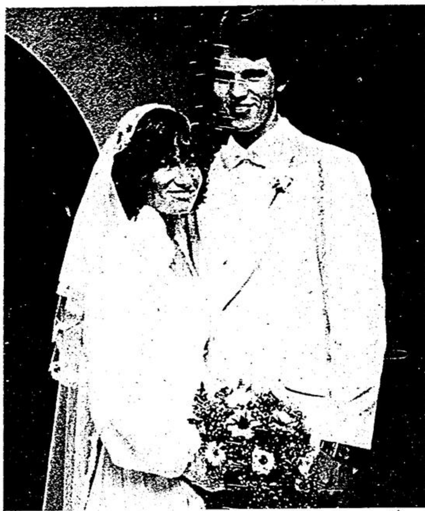
Pretty Markham wedding

Puppet Show Gronk is the intriguing name of the show which will be presented by T.V.