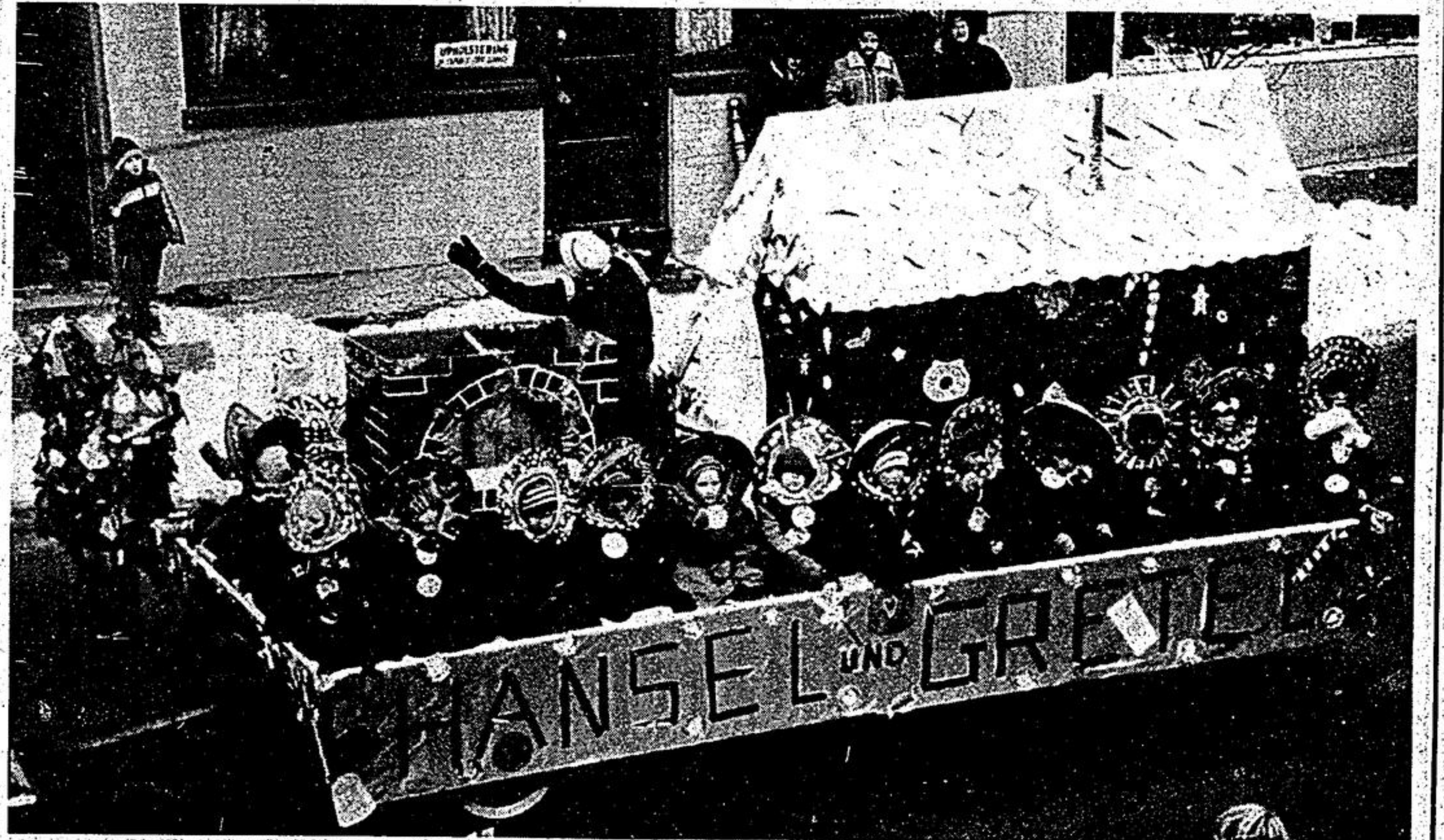
The oft-told story of Hansel and Gretel was portrayed by children of Stouffville's Summitview Public School.