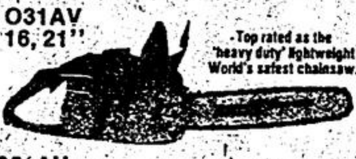
O31AV 16, 21"