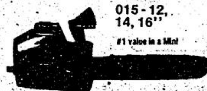
015-12, 14, 16" #1 value in a class