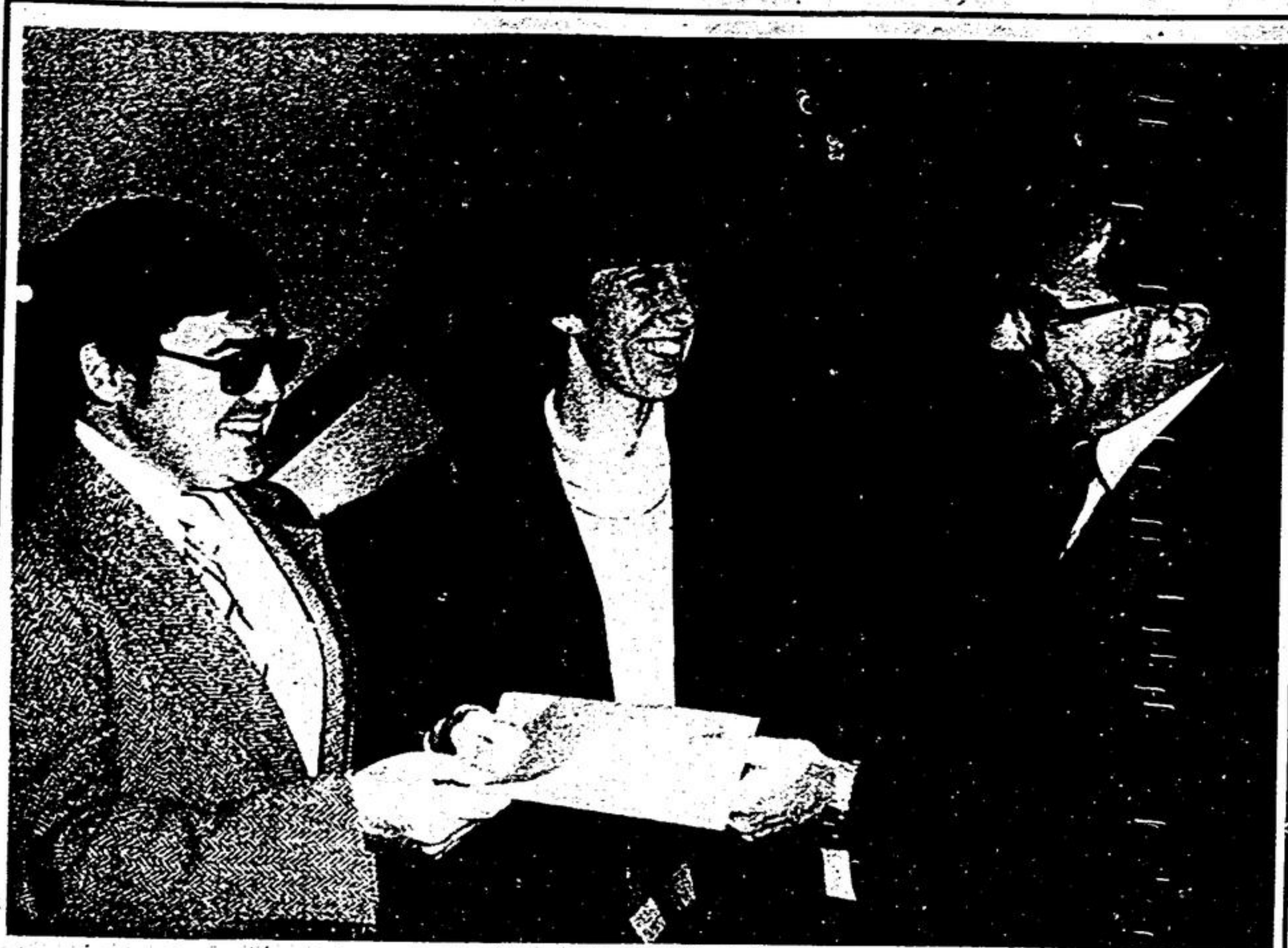
McNeil Company - employees add $1,000 to Terry Fox Fund

Whitchurch-Stouffville's Marathon of Hope has so far raised over $16,000 for the Terry Fox Fund with three thousand dollars pledged but not yet turned in. This week, McNeil Laboratories Limited and its employees added $1,000 to the total. A cheque for this