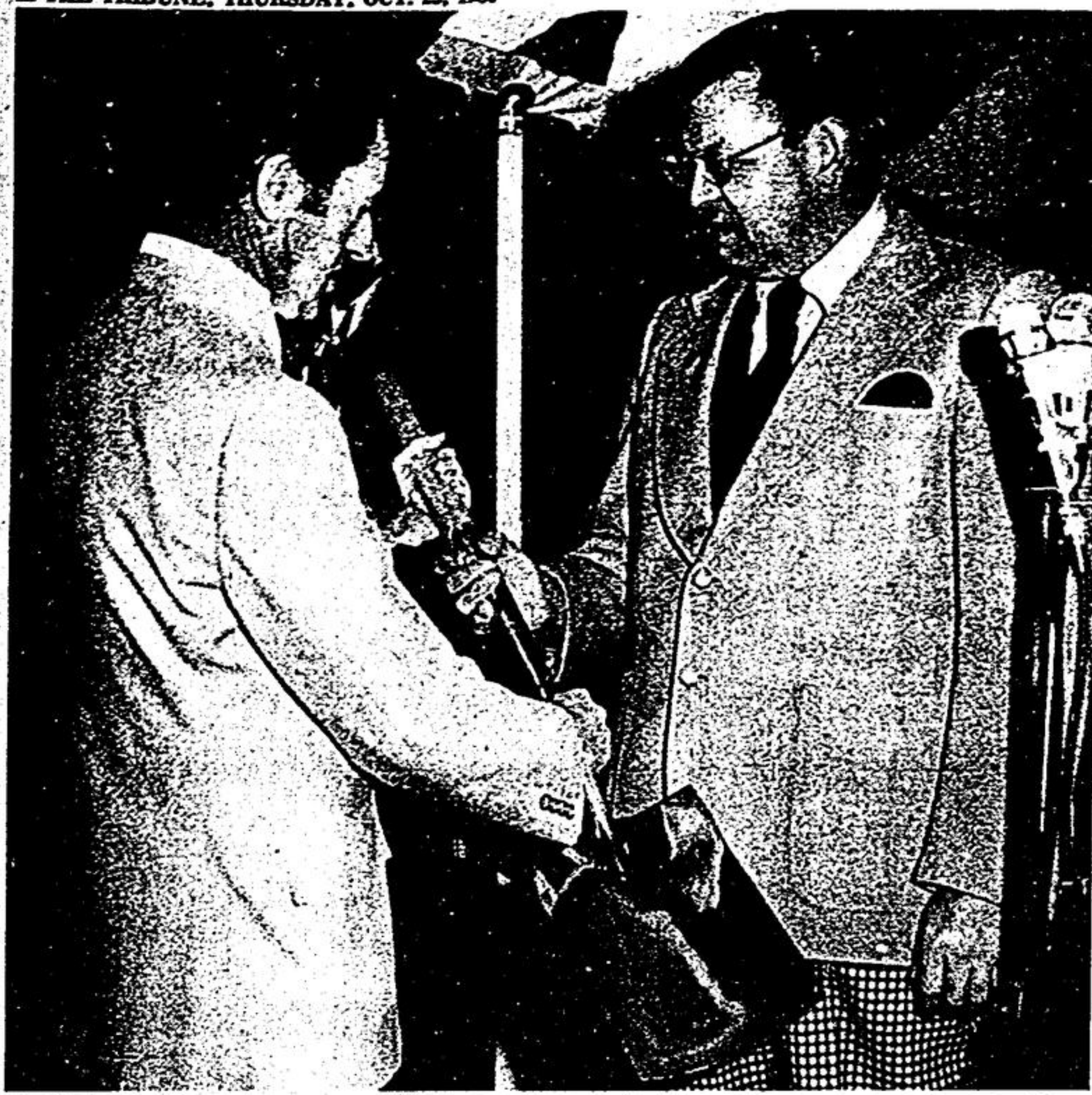
Markville's sod-turning spade donated to Town Museum