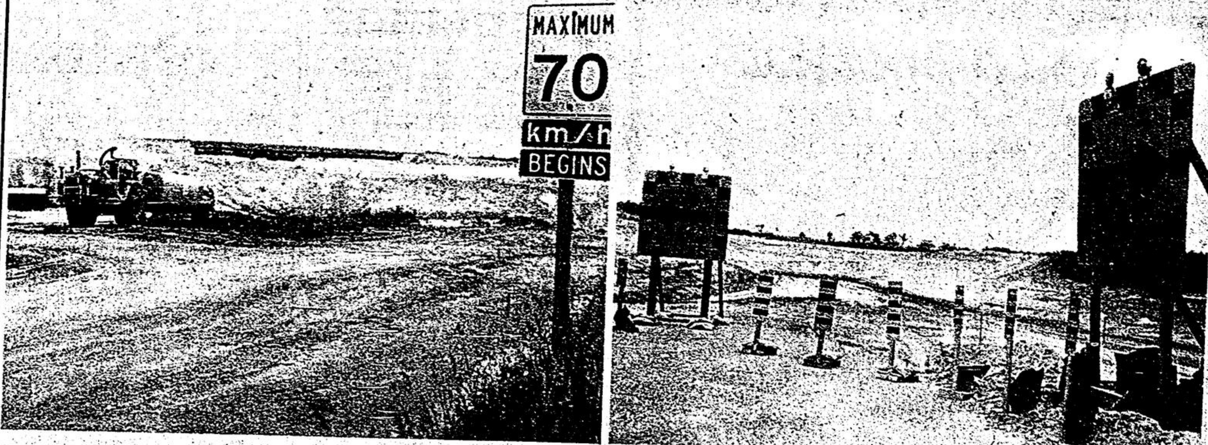
Former residents, returning to the hamlet of Gormley, might need a road map to find their way through the place, so greatly changed is the community. It's