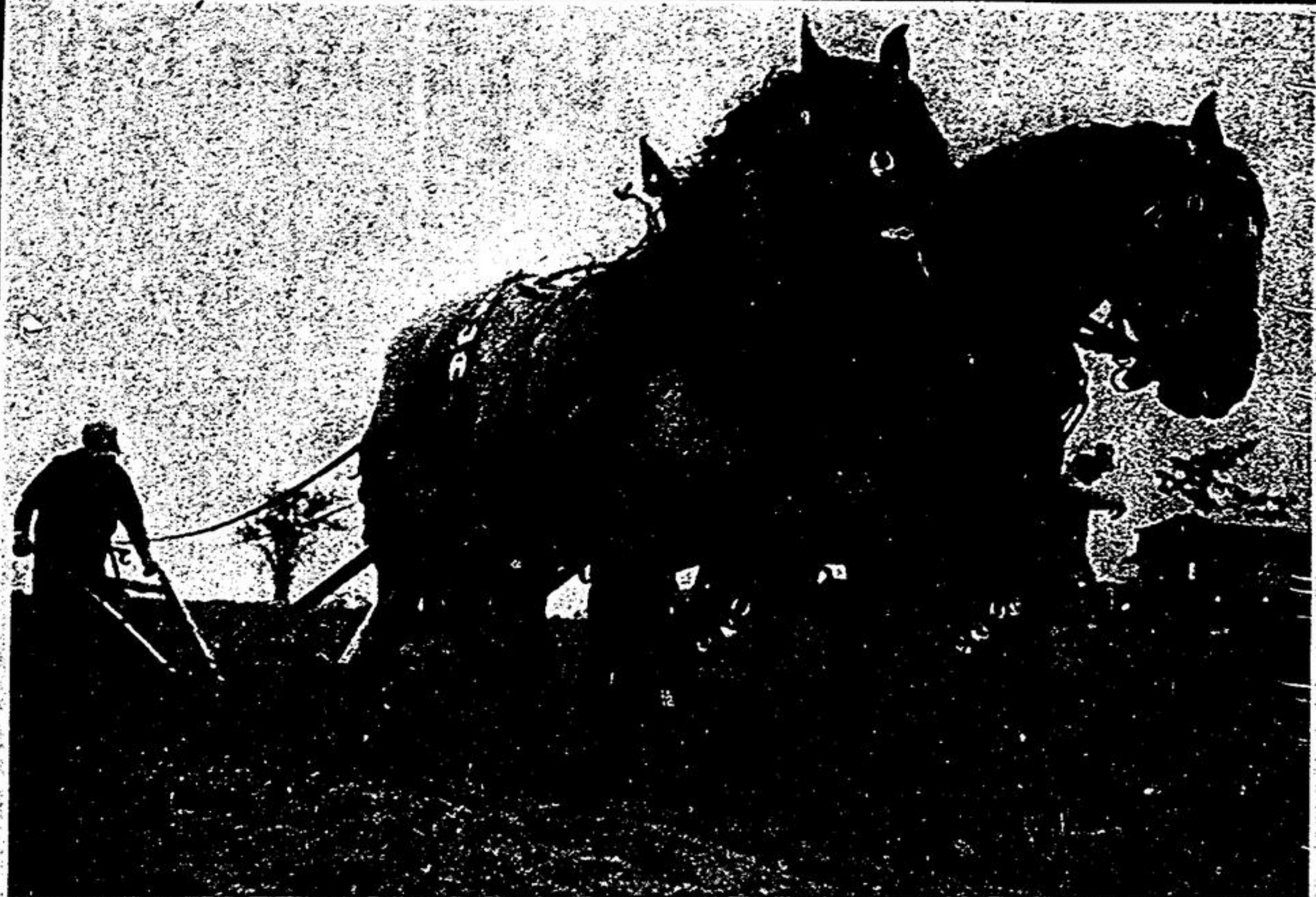
Horse plowmanship still has its place at branch and international matches although their numbers are small. Prominent in both areas of competition in-