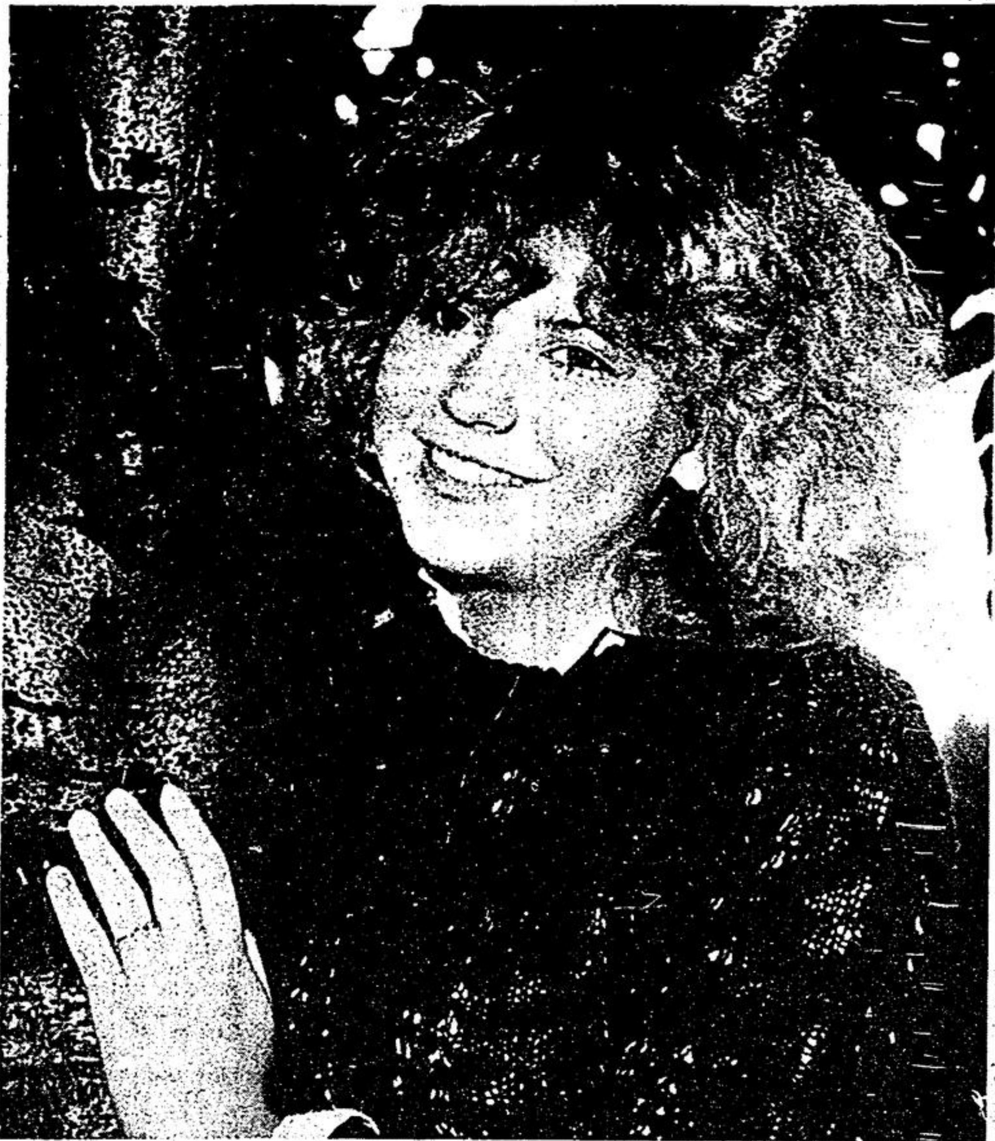
Will attend Seneca College following graduation