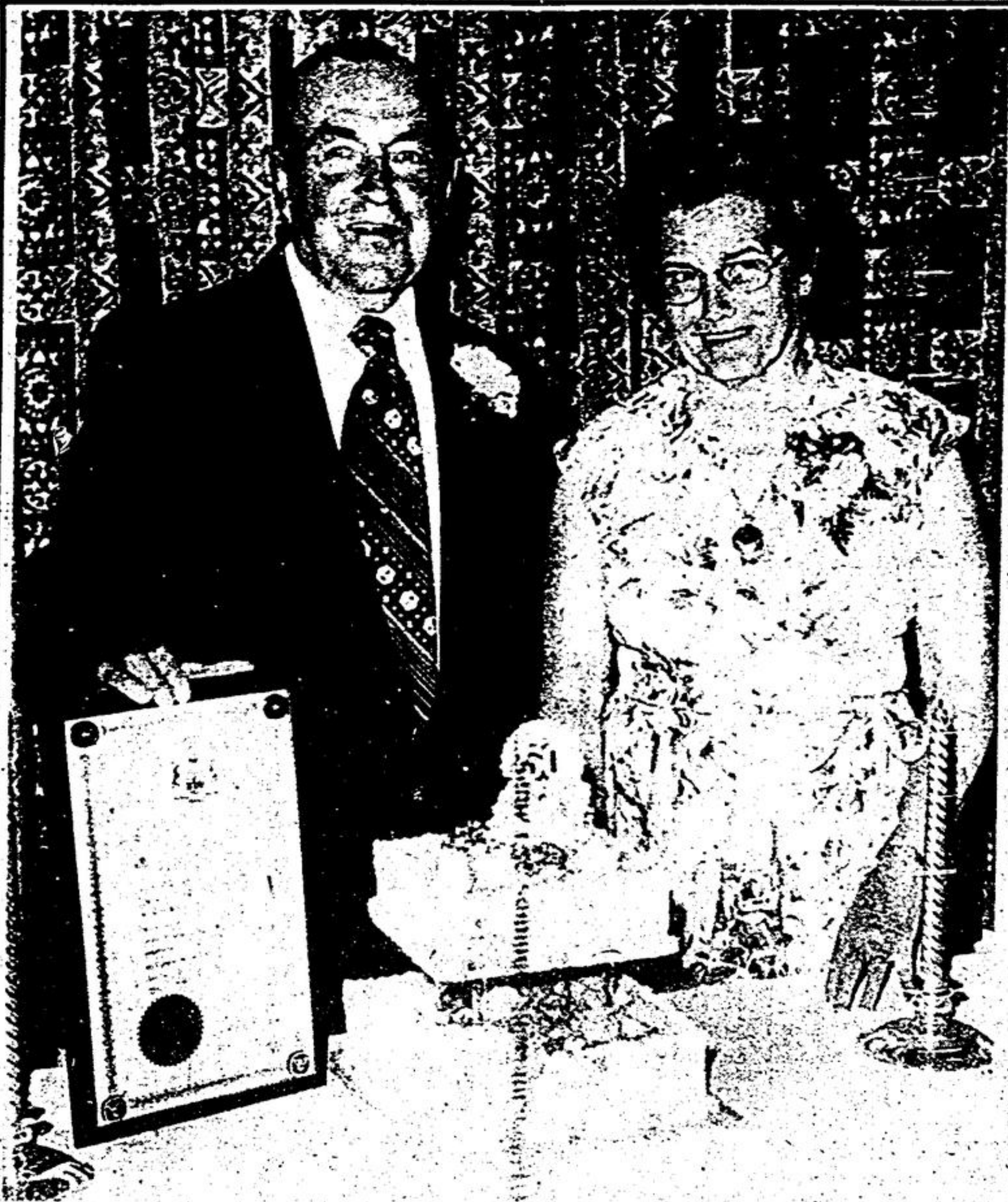
A "Golden Day" for Claremont area residents