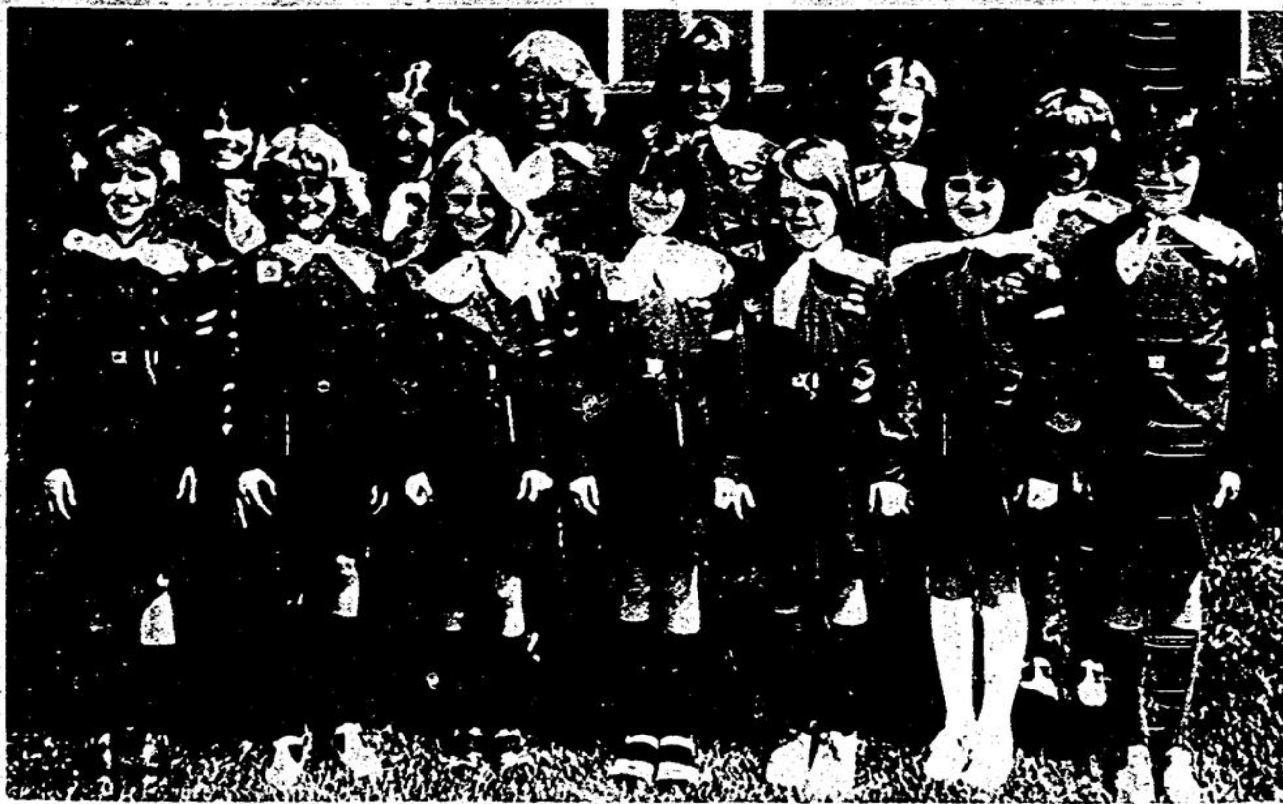
Stouffville Brownies "fly up" to Guides