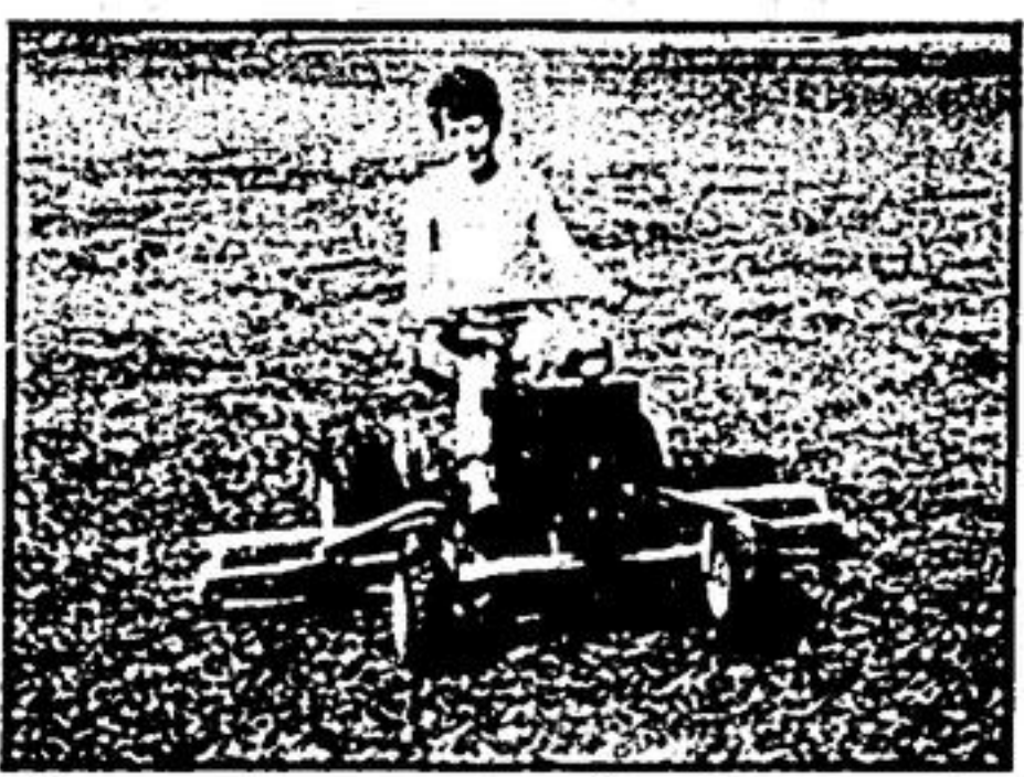
Safer to operate. Comfortable, easy to drive. With its low centre of gravity and wide track it hugs the ground. Doesn't throw objects as a rotary sometimes does.

The National isn't the prettiest mower because it was designed for professionals who put performance first. But it looks better every time you use it.