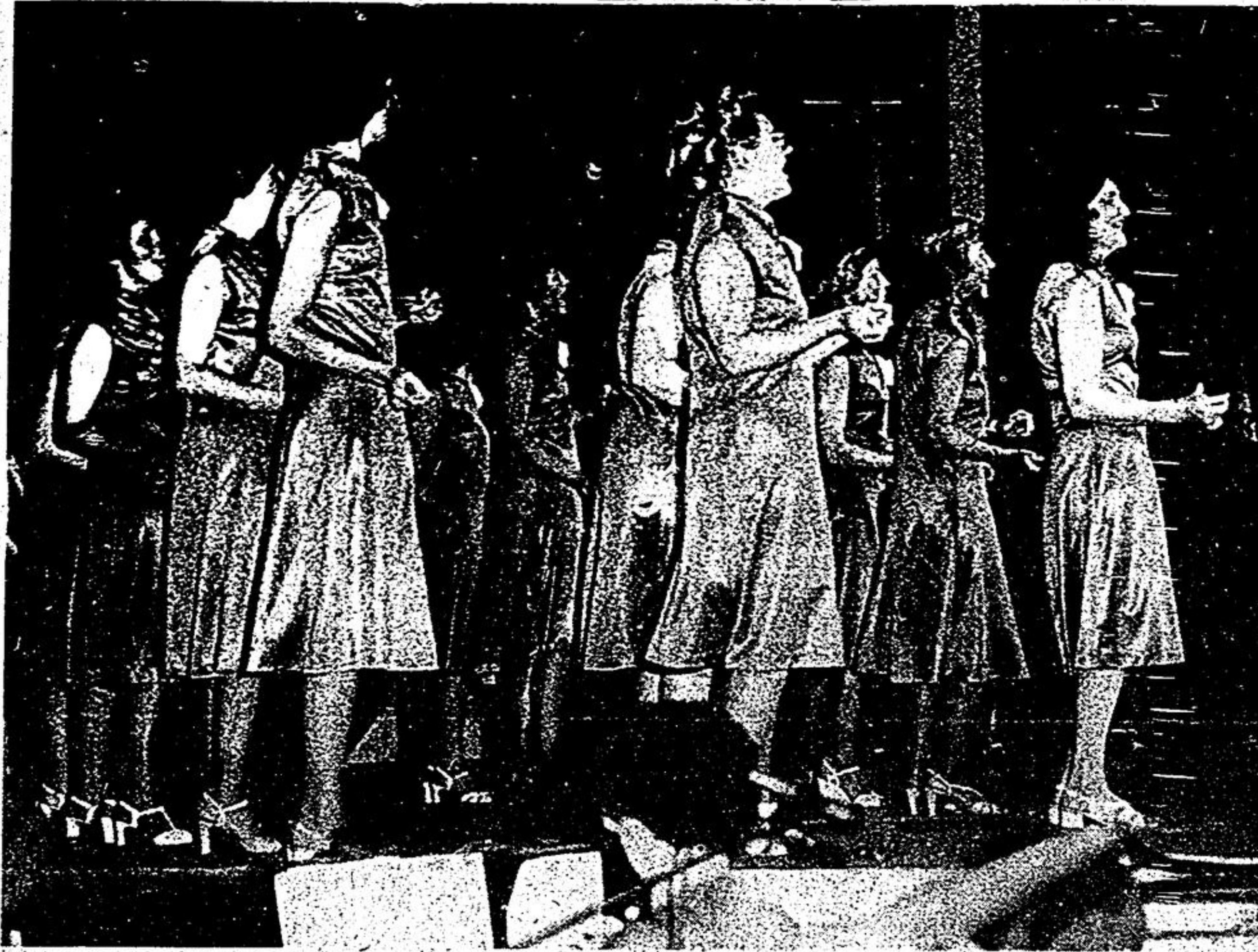
Music Mania completed its 20th anniversary milestone last week and already there's talk of "next year". The show

continues to be the most successful community event of its kind thanks, in part, to the chorus that this year numbered a record 76 members. This is how the orchestra sees them.