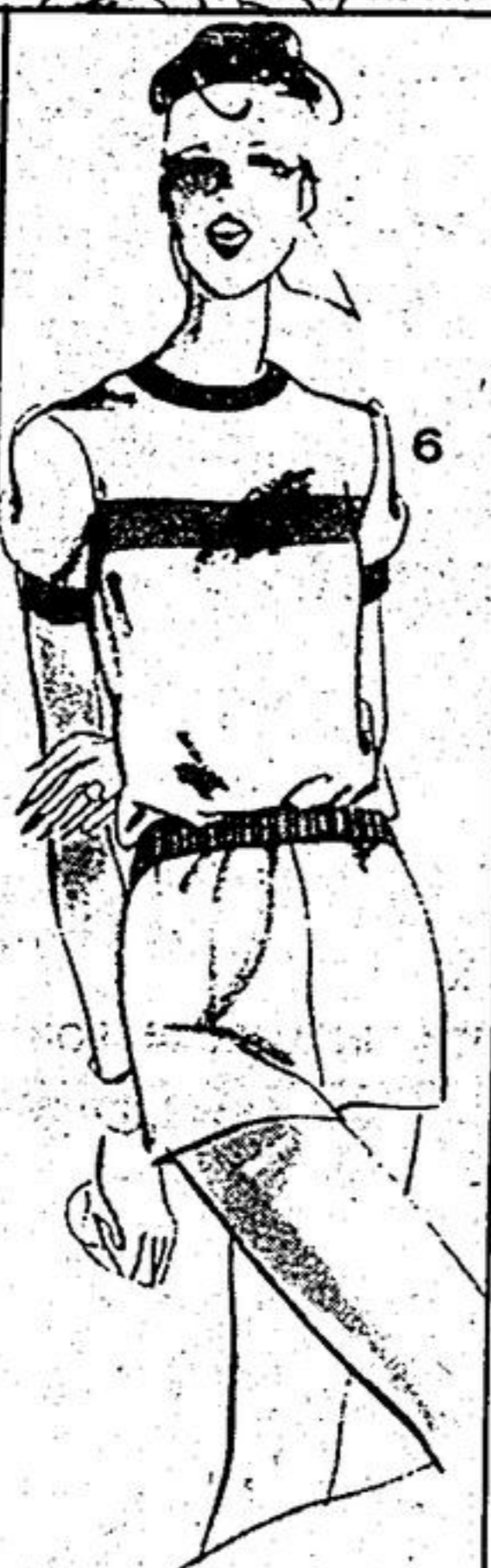
(6) 357 — 2-piece short set. Top is crew-necked with contrast trim. Shorts are solid shades with elastic waist. In cotton-and-polyester. White with turquoise trim and white with yellow trim. Sizes S., M., L. 2-pcs. 28.00 (DEPT. 248)