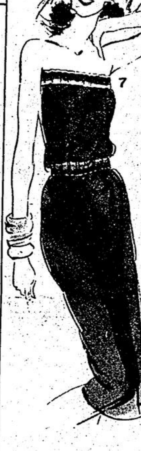
(7) 308 — A bare little tube dress in polyester terry with multi-coloured elastic at the top and waist. In red or yellow. Sizes S., M., L. Each 28.00 (DEPT. 341)