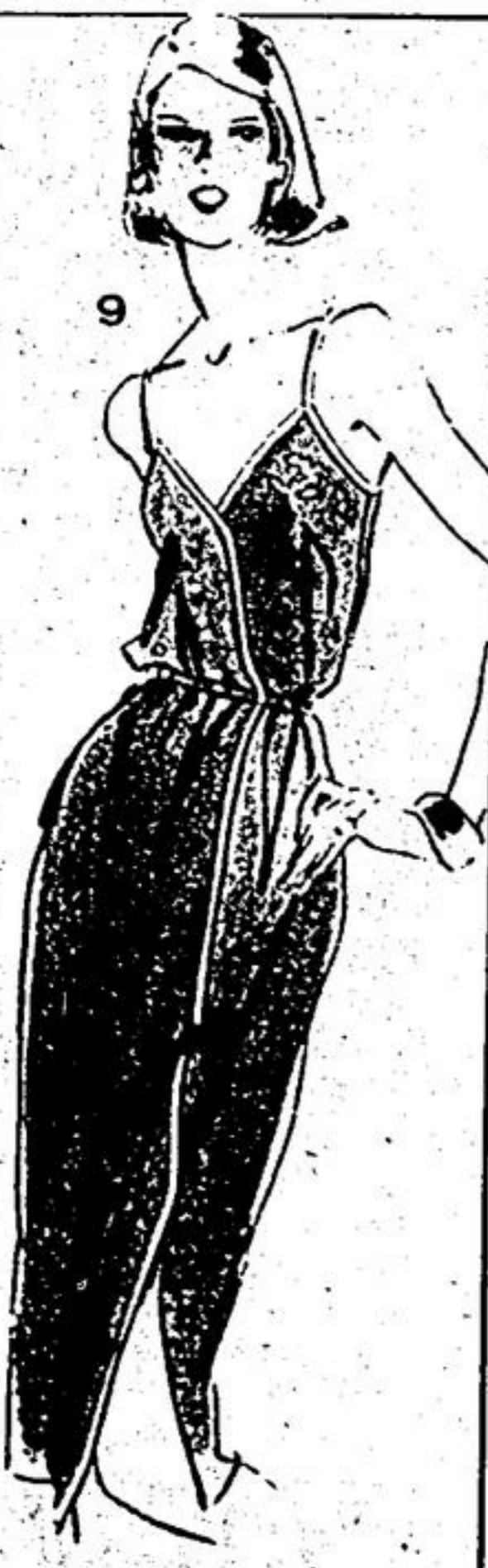
(9) 357 — Wrap-look sundress with elastic waist. Cotton-and-polyester. Turquoise or yellow with white trim. Sizes S., M., L. Each 30.00 (DEPT. 248)