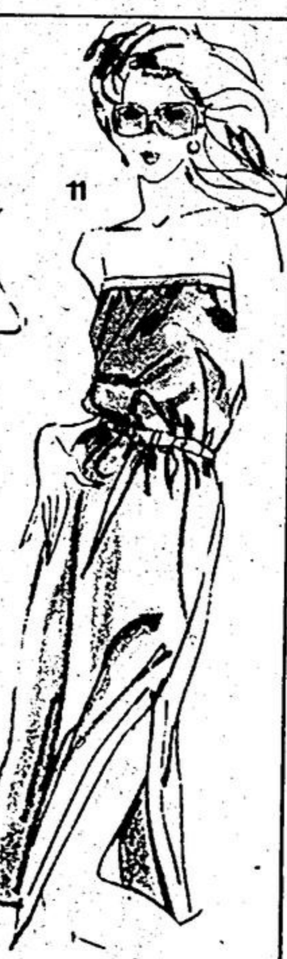
(11) 234 — Strapless tube dress in cotton terry. Elastic waist. In green, yellow or purple. Sizes S., M., L. Each 38.00 (DEPT. 442)