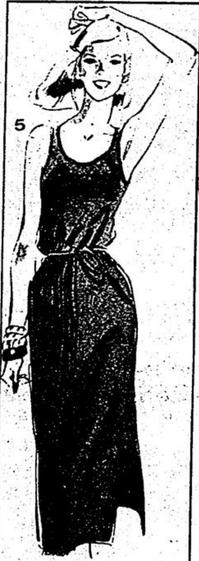
(5) 579 — Cool little polyester terry dress with scoop neck and self-tie belt. In orange/red, royal blue or yellow. Sizes 10 to 18. Each 24.99 (DEPT. 741)