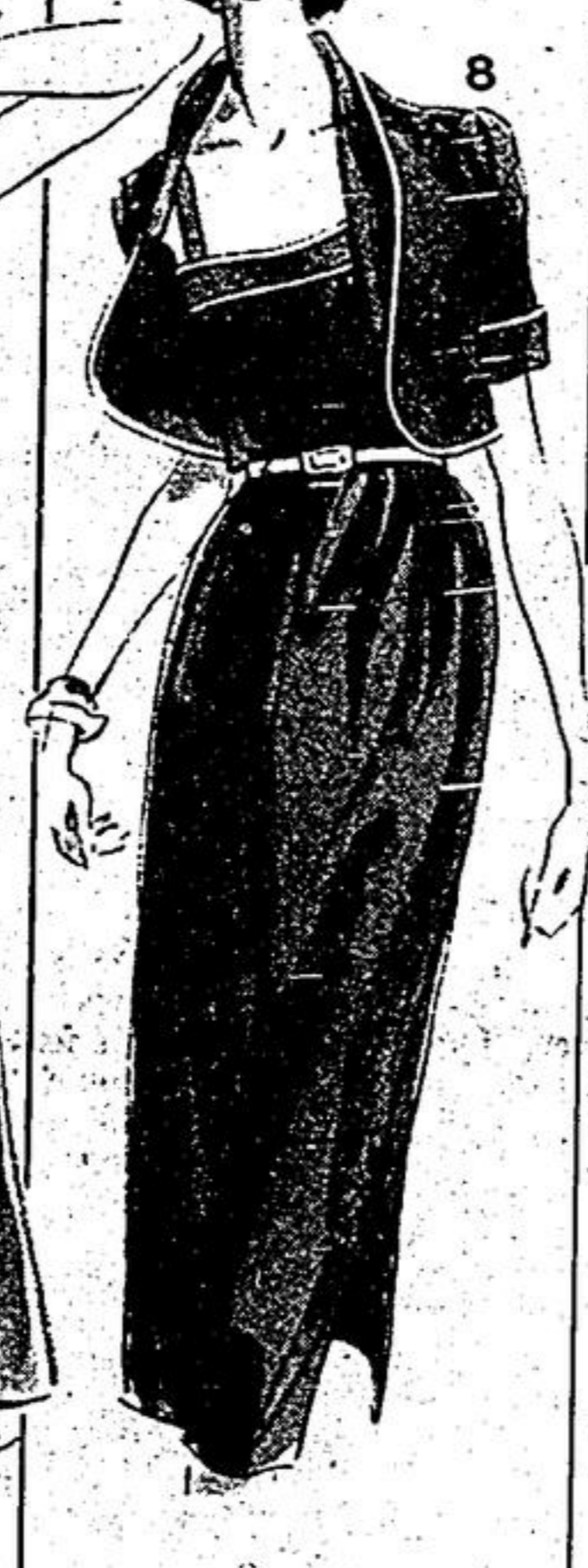
(8) 306 — Terry to wear day or night... polyester terry sundress with cover-up bolero jacket. In navy or red with white trim. Sizes 8 to 16. 2-pcs. 42.00 (DEPT. 341)