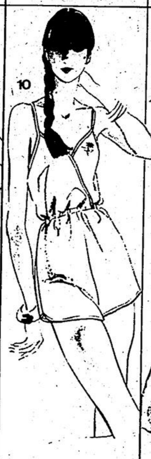
(10) 357 — Cross-over front playsuit in cotton-and-polyester. White with turquoise trim or yellow with white trim. Sizes S., M., L. Each 24.00 (DEPT. 248)