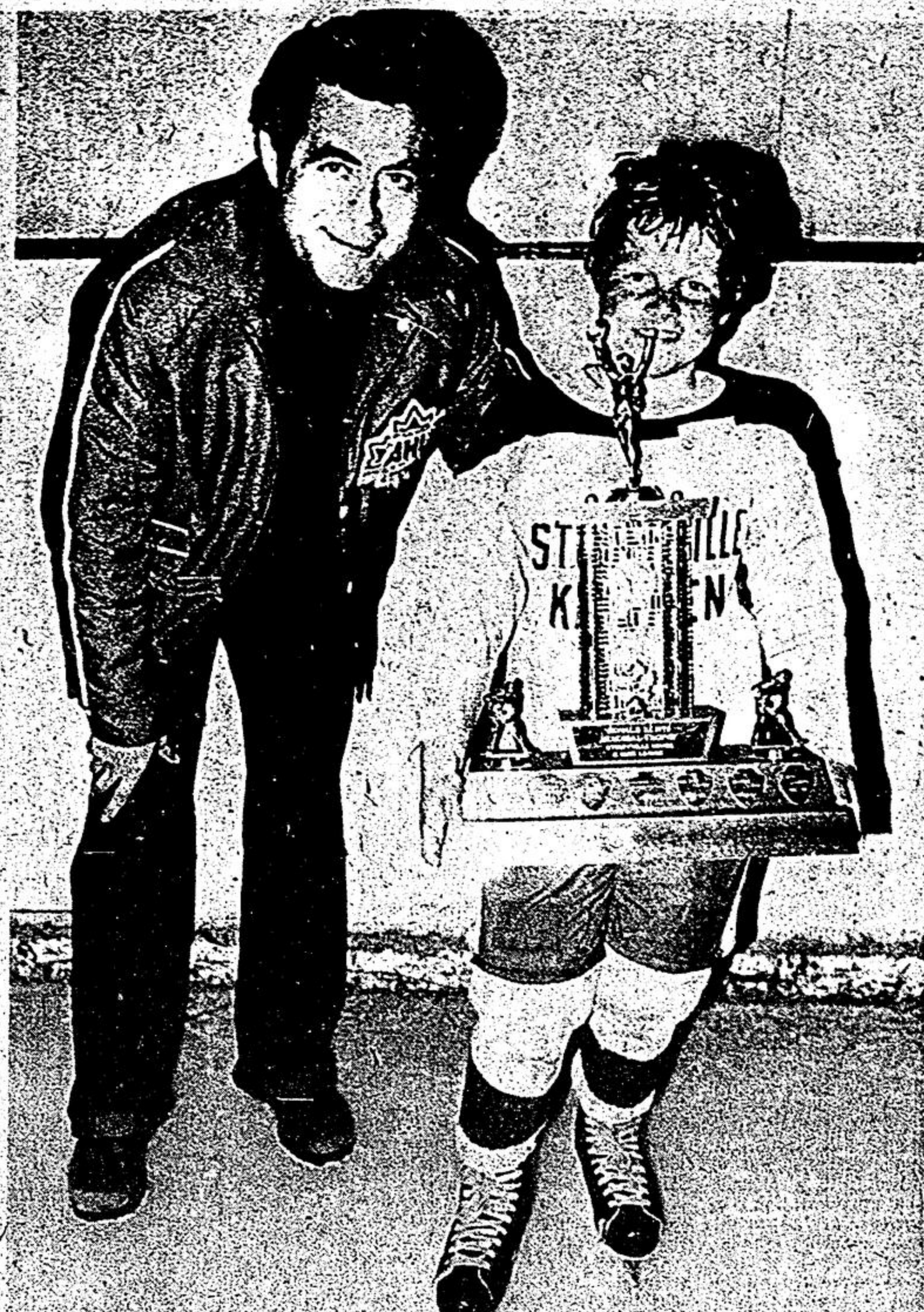
Like father-like son