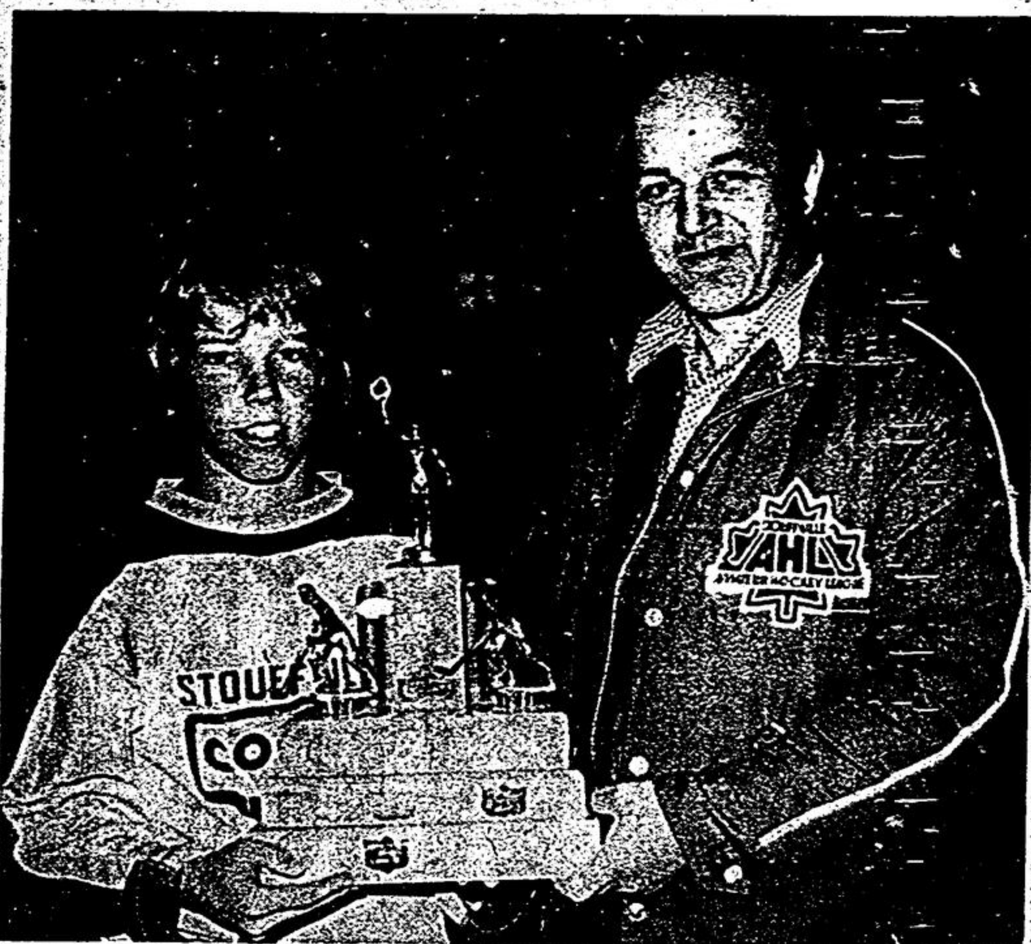
Peewee League Champions