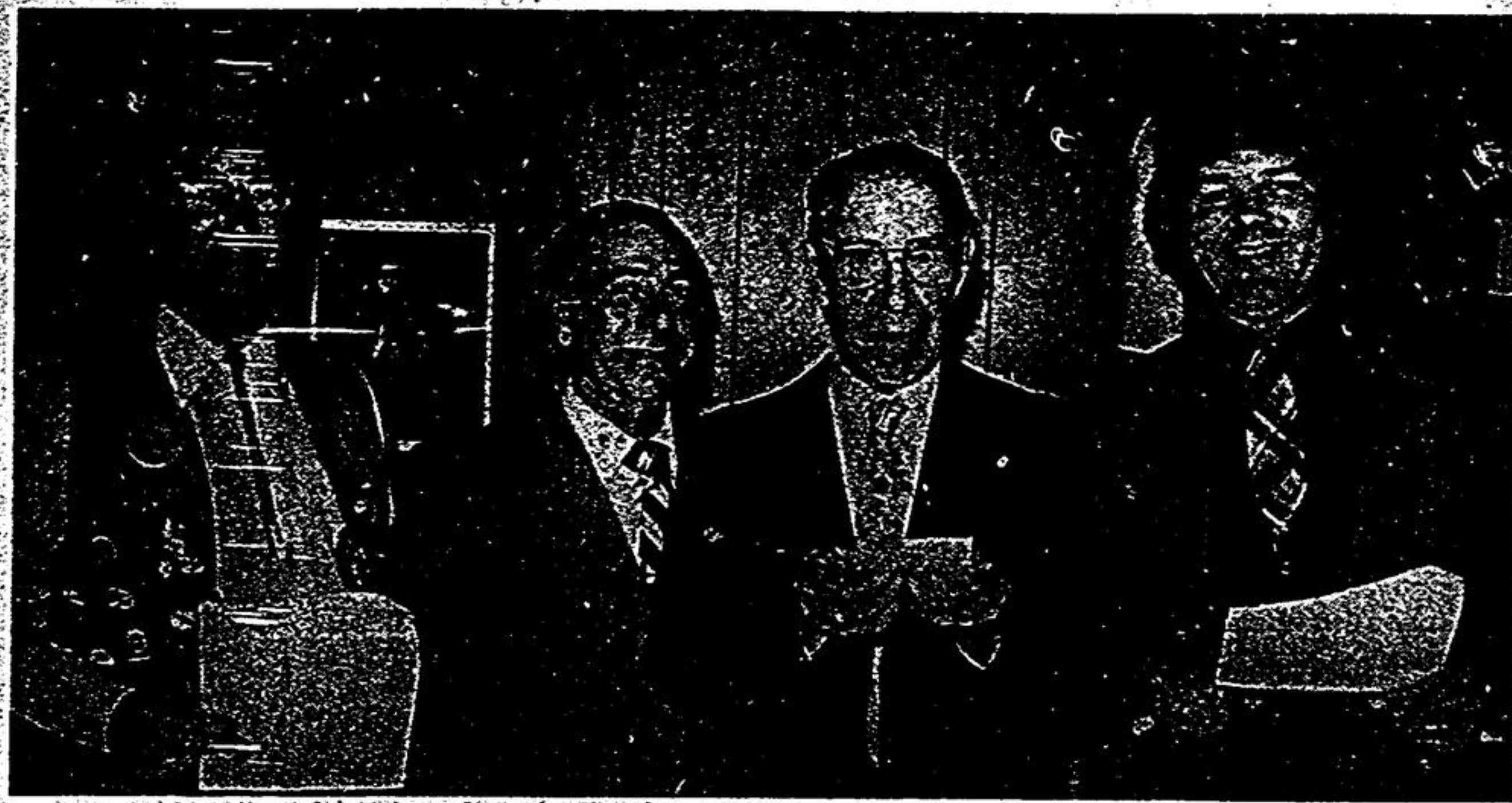
Stouffville man wins expense-paid trip to Freeport, The Bahamas