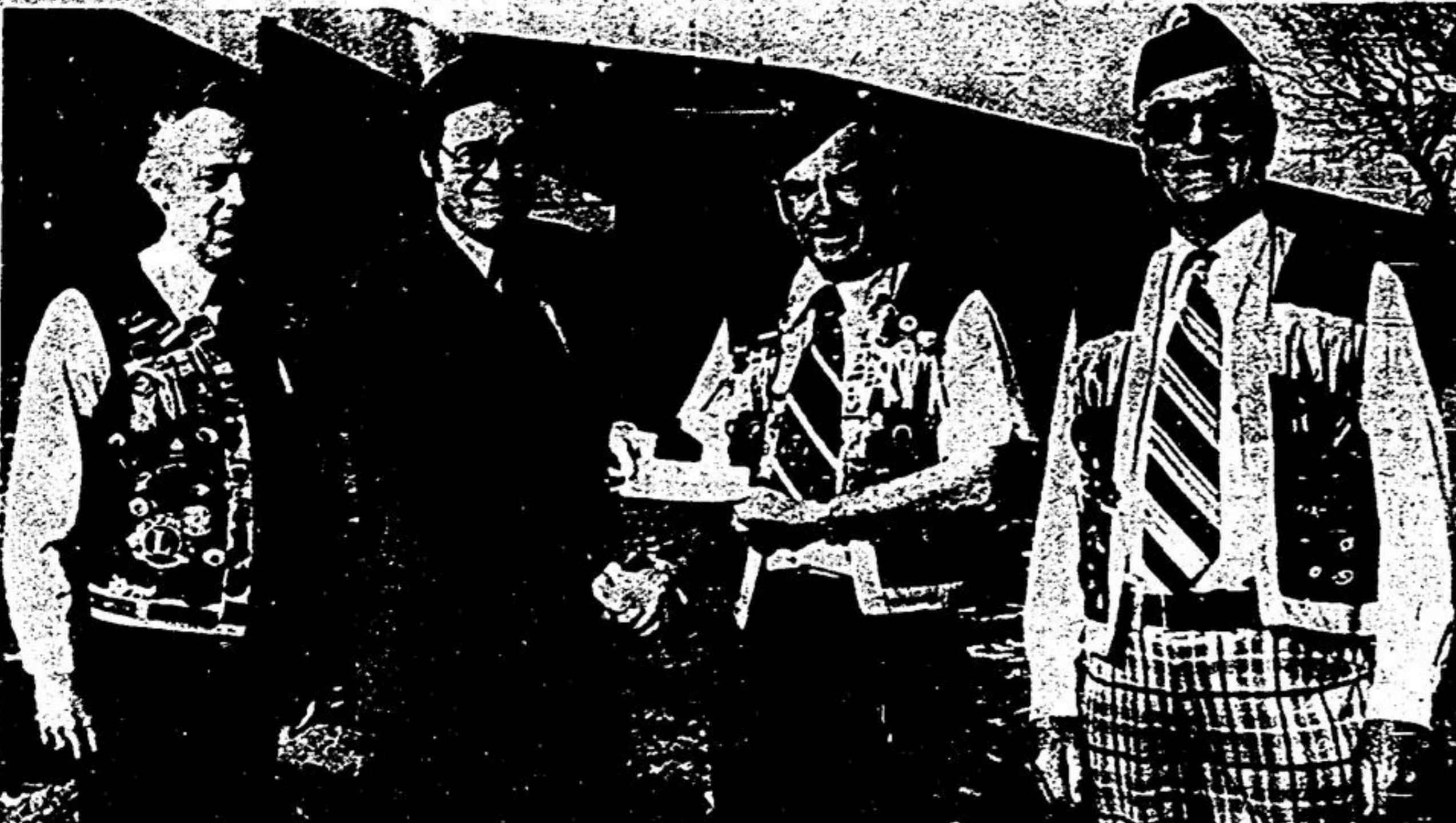
The Unionville Home Society (Union Villa) is in the midst of building senior citizens' bungalows and a community recreation centre on the property. To assist this project, the Markham Lions Club recently donated $3,000. Presenting the cheque here to Home Society