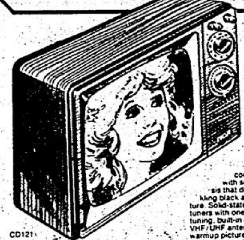
RCA ComPact 12 Sportable TV

FREE Black & White Sportable with the purchase of either of these new RCA XL-100 Color TV consoles