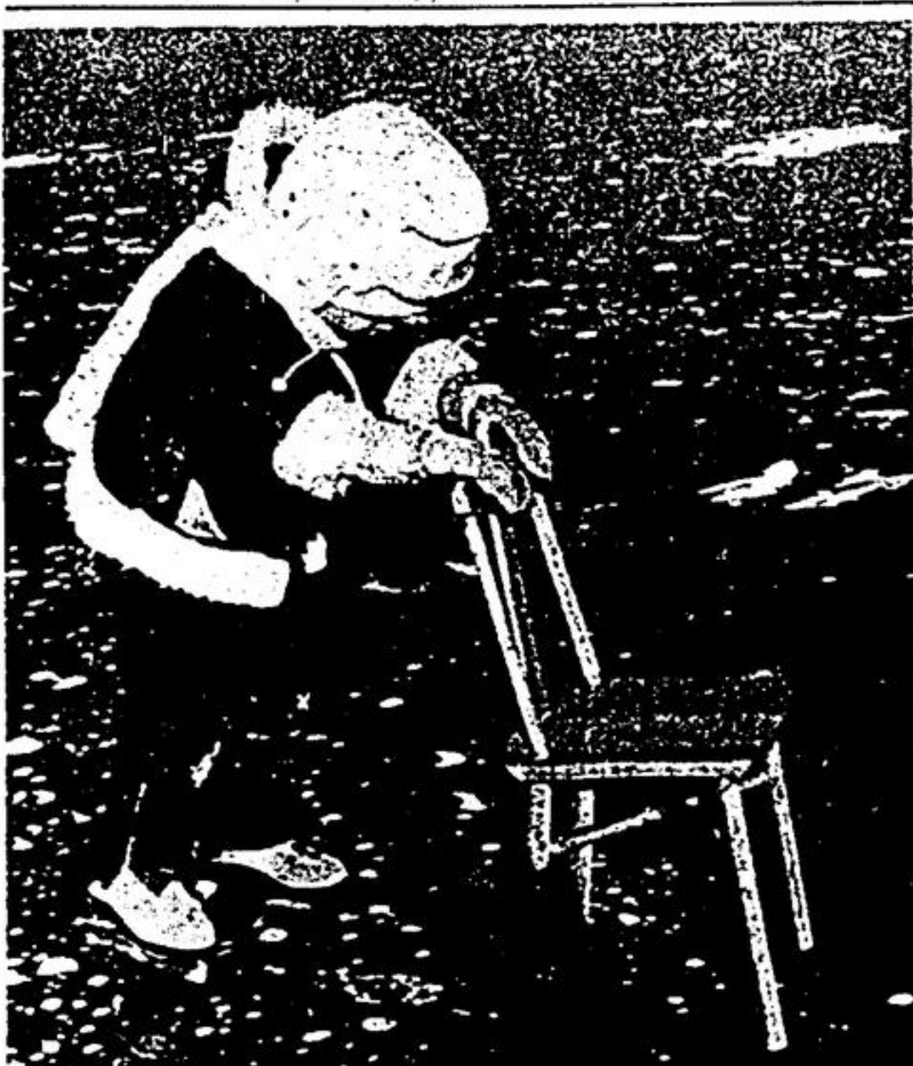
EASY DOES IT