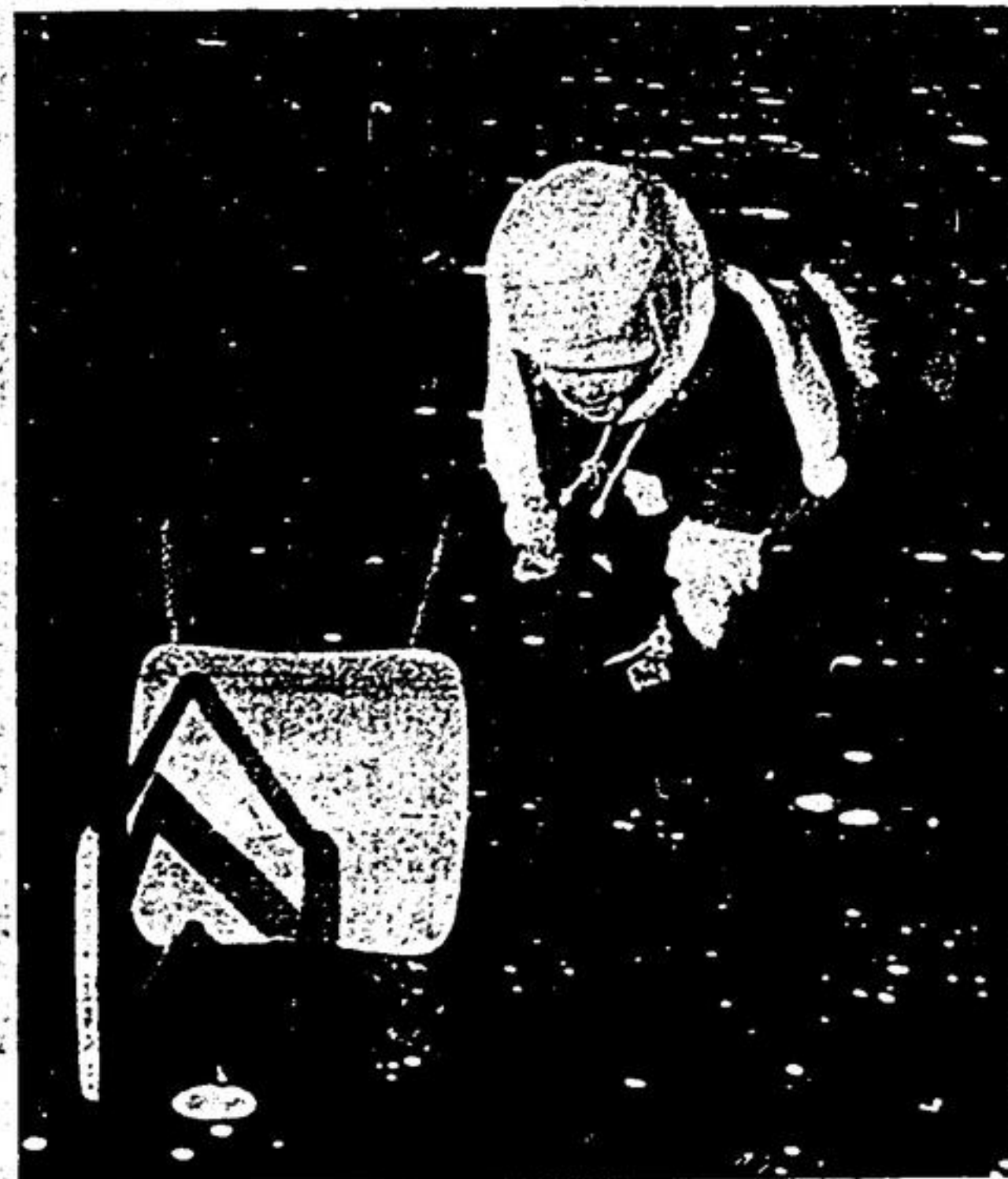
HEY COME BACK