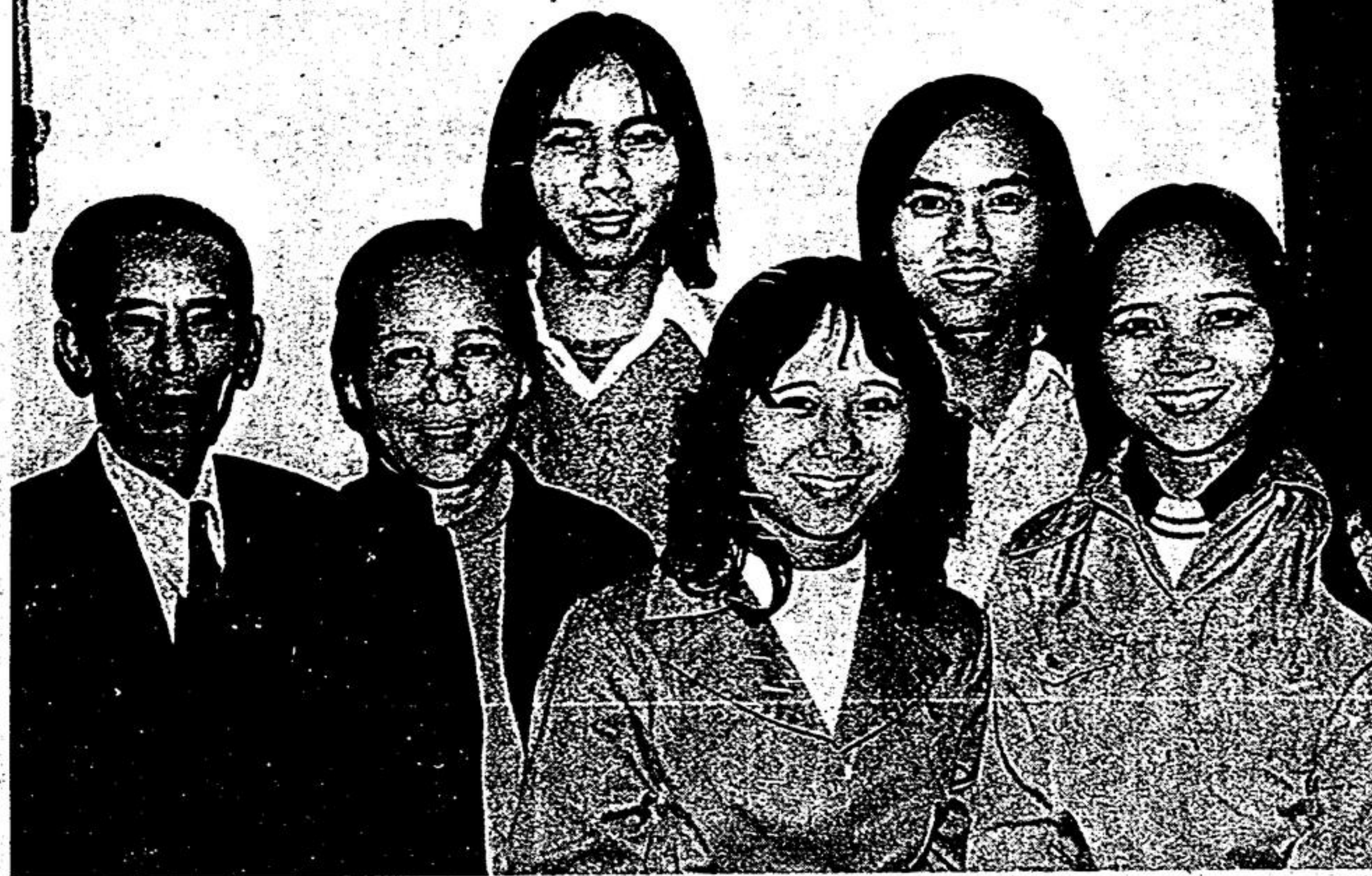
The Hoang family from Vietnam, recent arrivals in Stouffville under the sponsorship of the Missionary Church, have taken up residence in a home on Main Street East.

Communication presents a problem, but even in their short time here, they're catching on to English quickly. They're attending language classes two hours each day.