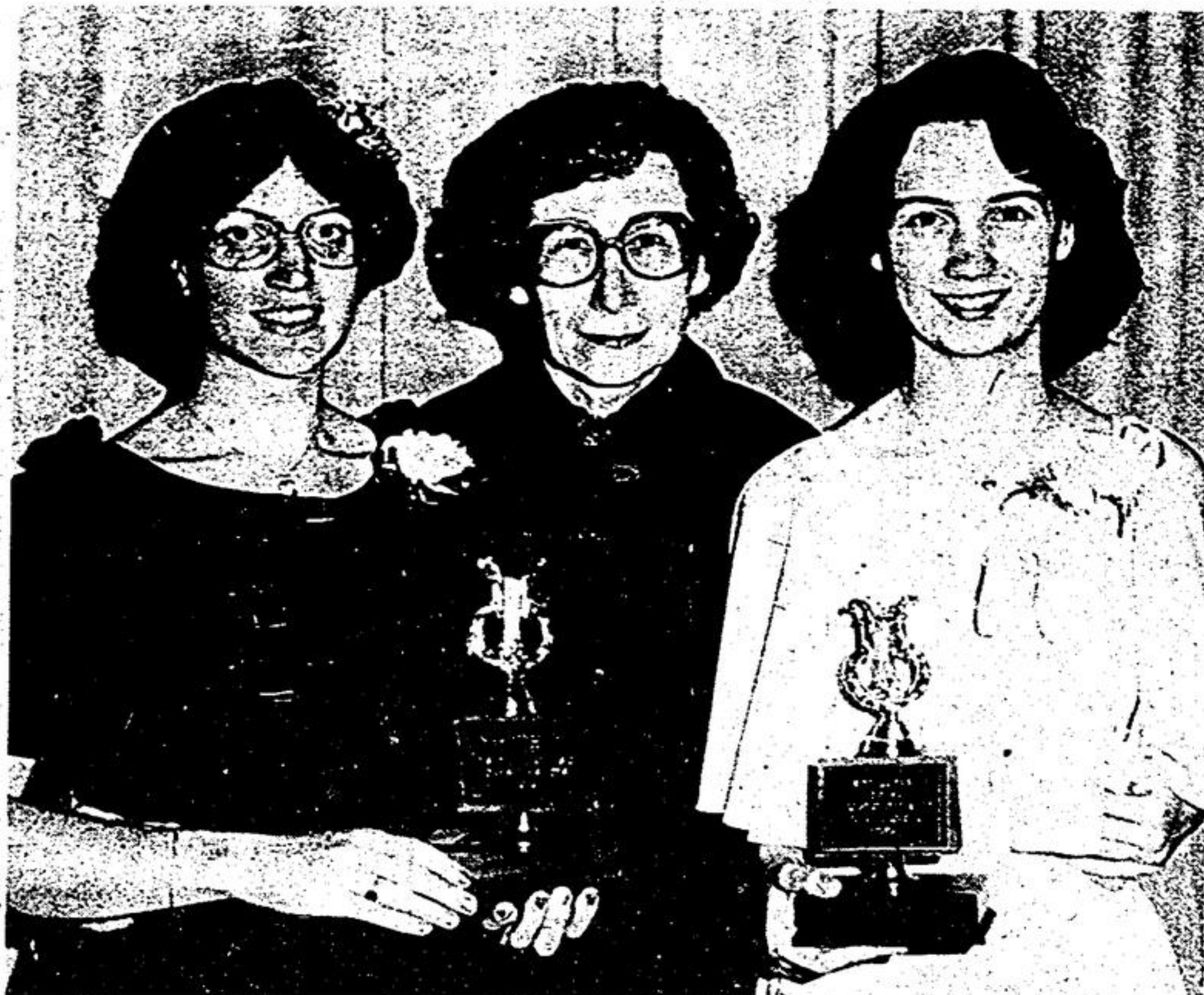
Students share memorial music award