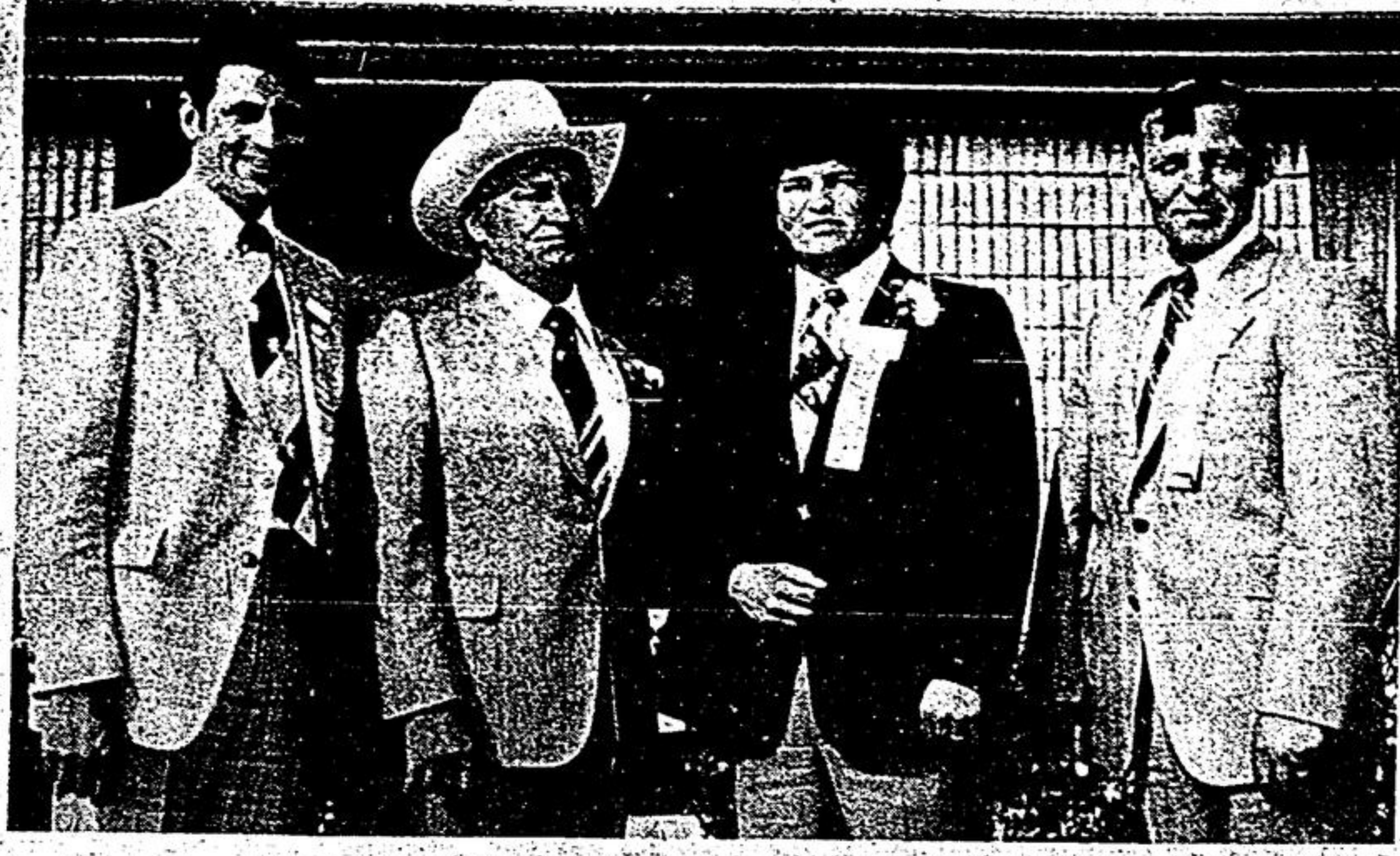
The Hon. Eugene Whelan (second-left), former federal minister of agriculture, officiated at the opening of Markham Fair, Saturday. On