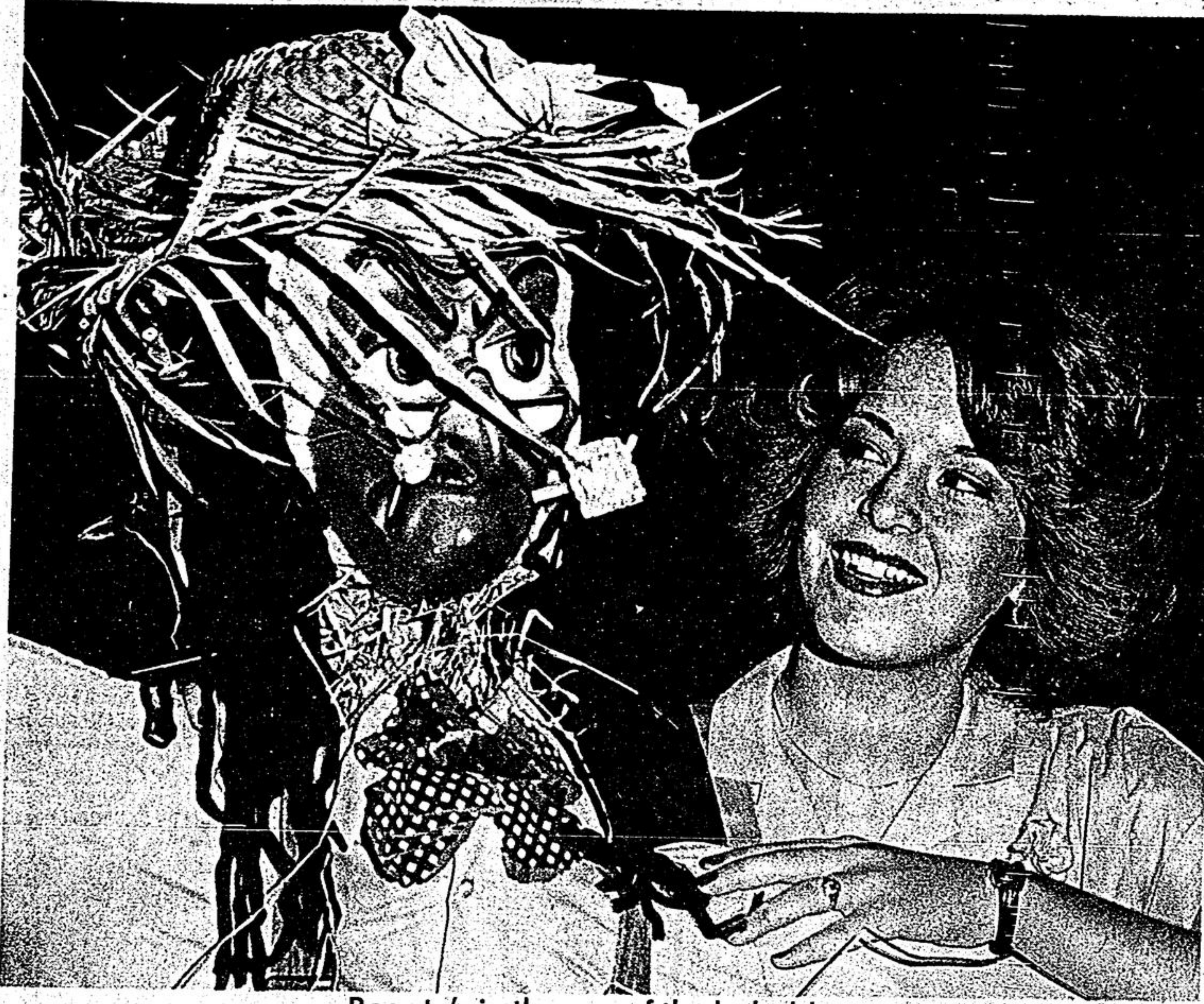
Beauty's in the eye of the beholder

Beauty's in the eye of the beholder, so they say. To the Board and directors of Markham Fair, it represented four perfect days, record crowds and buildings filled with exhibits. To the students in