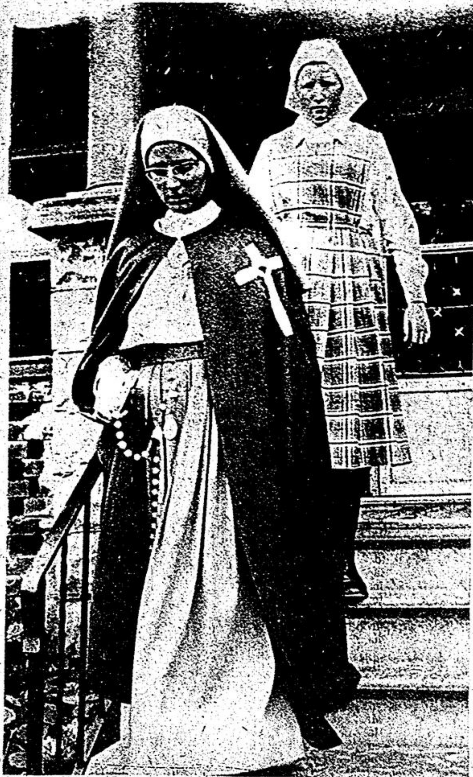
Sisters canvass to re-build monastery