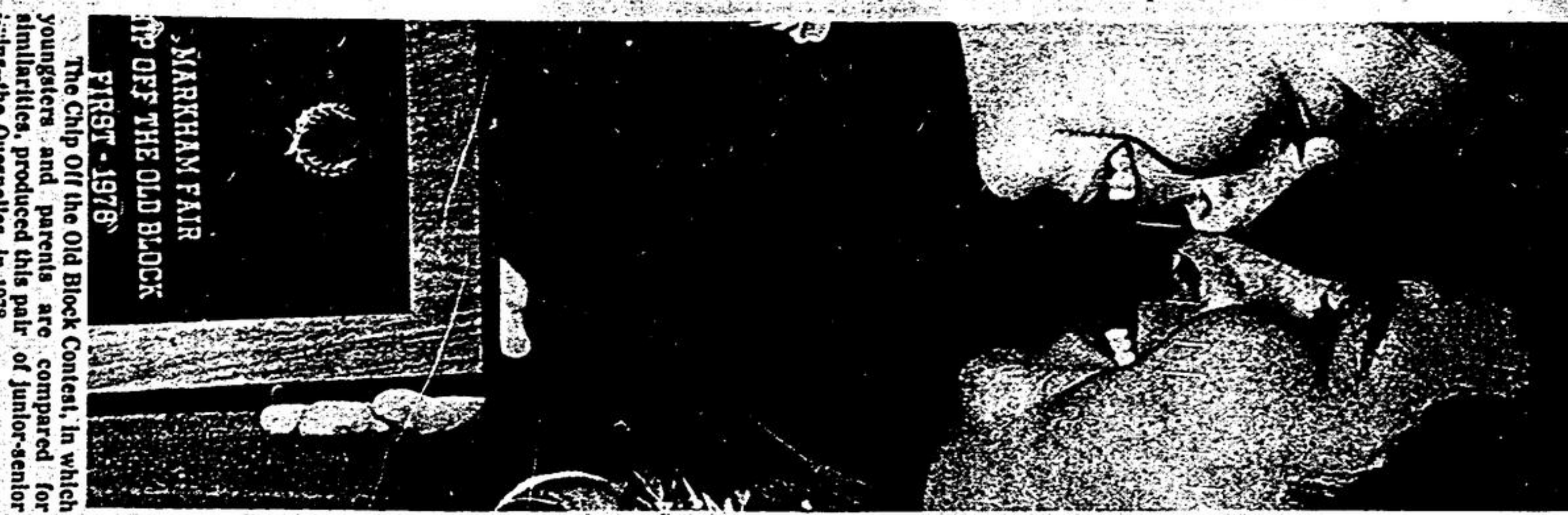
MARKHAM FAIR CHIP OFF THE OLD BLOCK FIRST - 1978 The Chip Off the Old Block Contest, in which youngsters and parents are compared for similarities, produced this pair of junior-senior winners - the Questelles - in 1978.

Including: K-Mart, Dominion, Food City, Towers