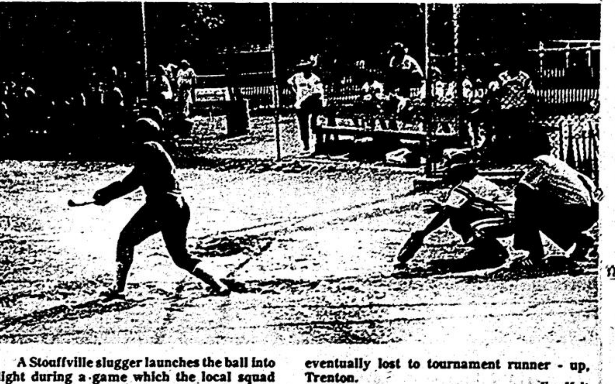
A Stouffville slugger launches the ball into flight during a game which the local squad eventually lost to tournament runner-up, Trenton.