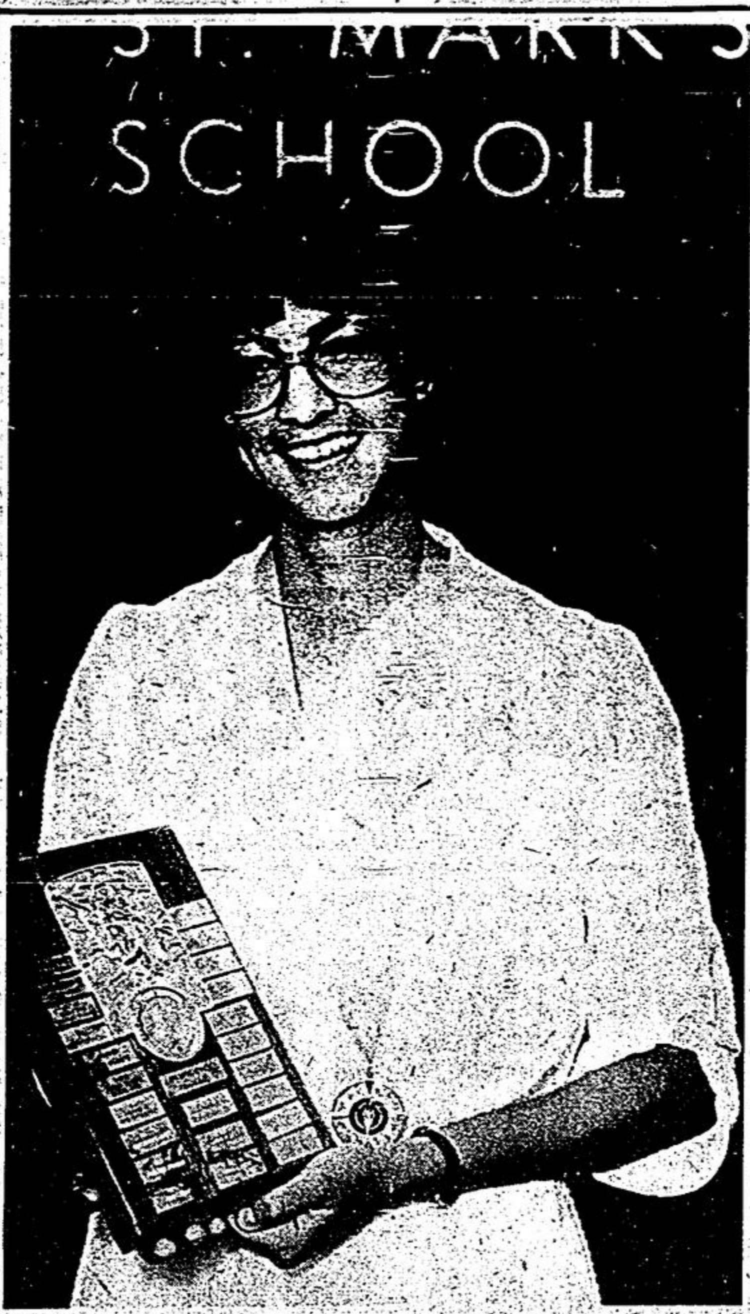
Outstanding girl at St. Mark's

The Historical Society will be holding a dance on Friday, July 13 (tomorrow) to celebrate the opening of the new implement building and raise funds for the organization. Tickets are available at the museum.