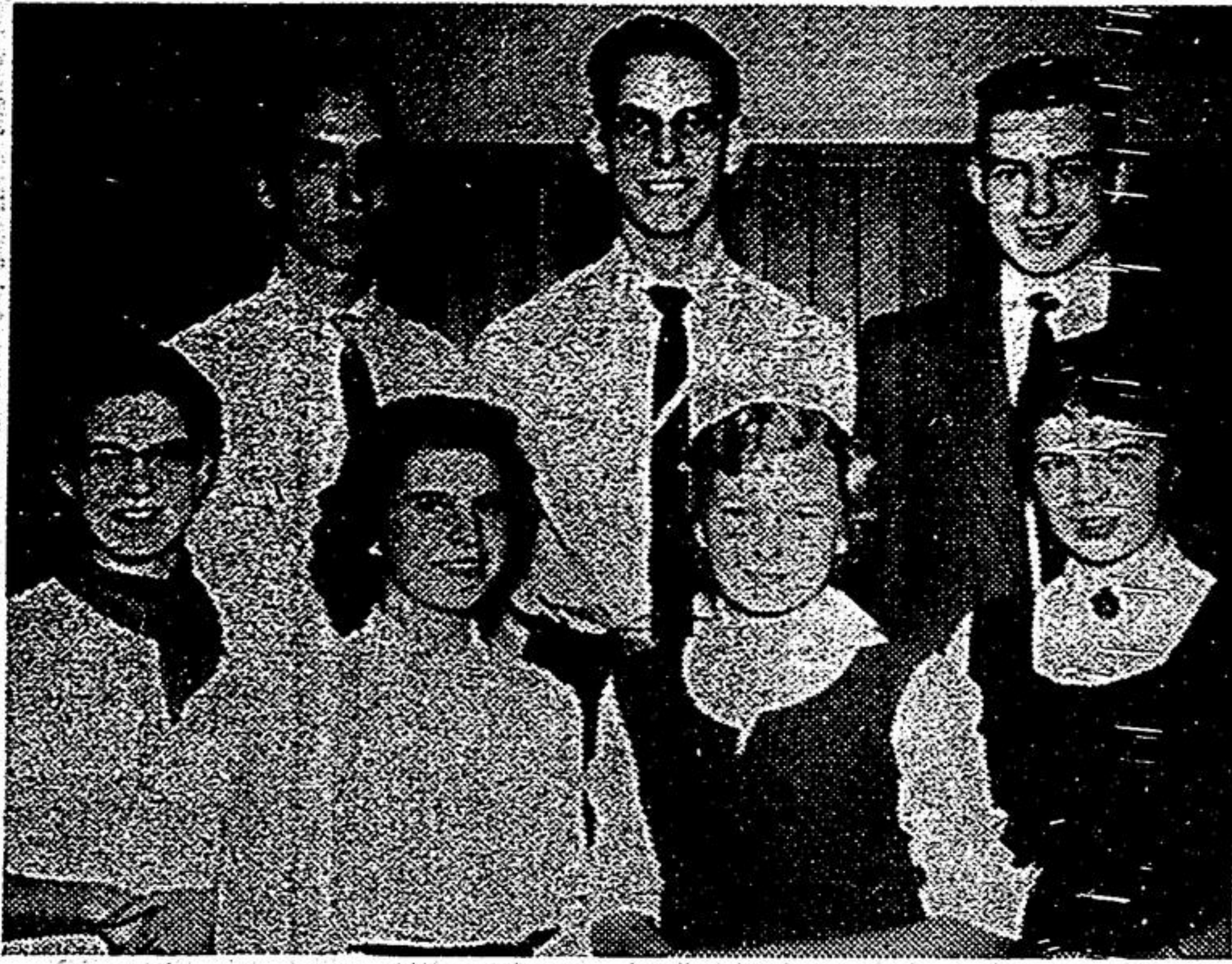
These students served on the executive of Stouffville High School's Christian Fellowship in 1956-57. Many of them will be back in Stouffville, June 23, when S.D.S.S. holds its 25th anniversary reunion.

Through the years, many students have participated in this organization and