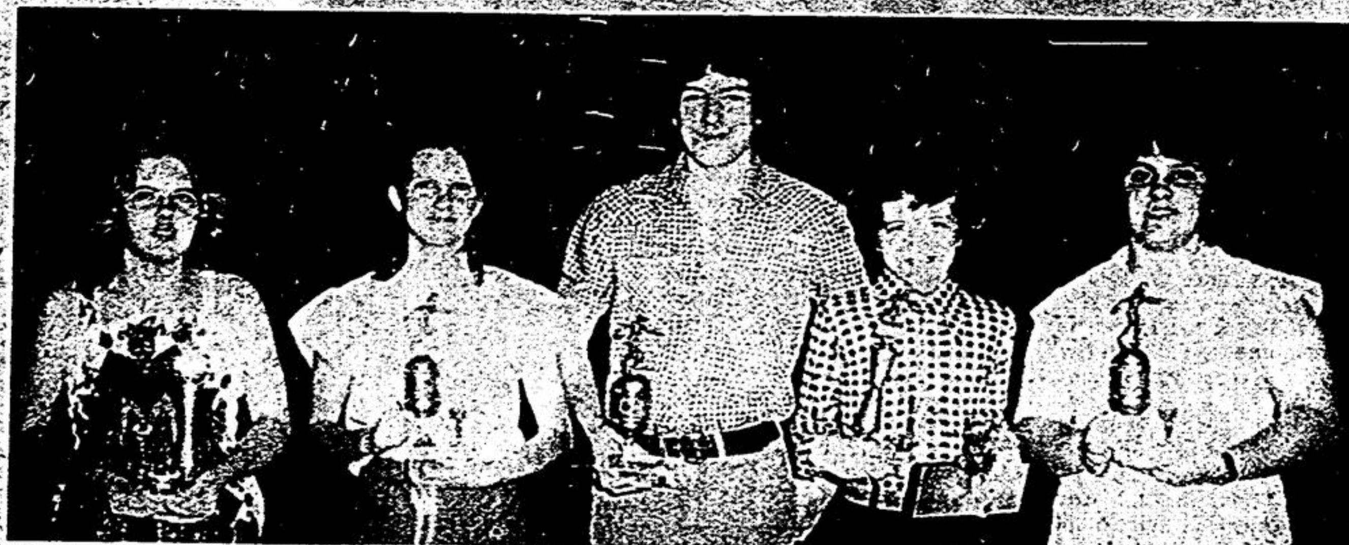
Y. B. C. entries win High Average awards

Brooklin Concrete Products limited Highway 12, Brooklin, Ontario 416-655-3111 Yonge St., Newmarket, Ontario 416-895-2373 Highway 11, Huntsville, Ontario 705-789-2338 Hwy. 121, Haliburton, Ontario 705-457-1395