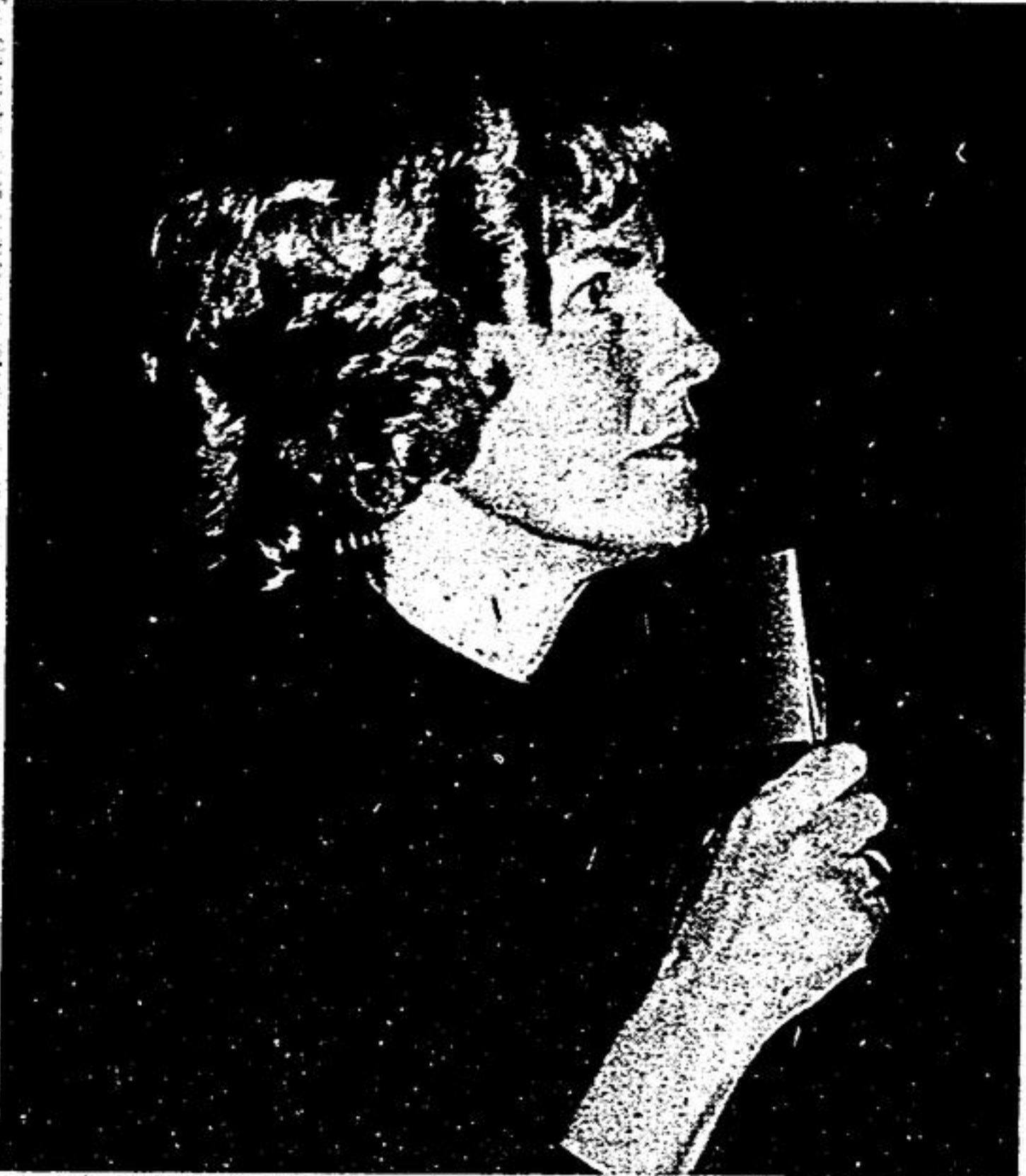
The practising's over and the big show's about to begin—Music Mania '79 on stage to-night, Friday and Saturday at Stouffville Dist.