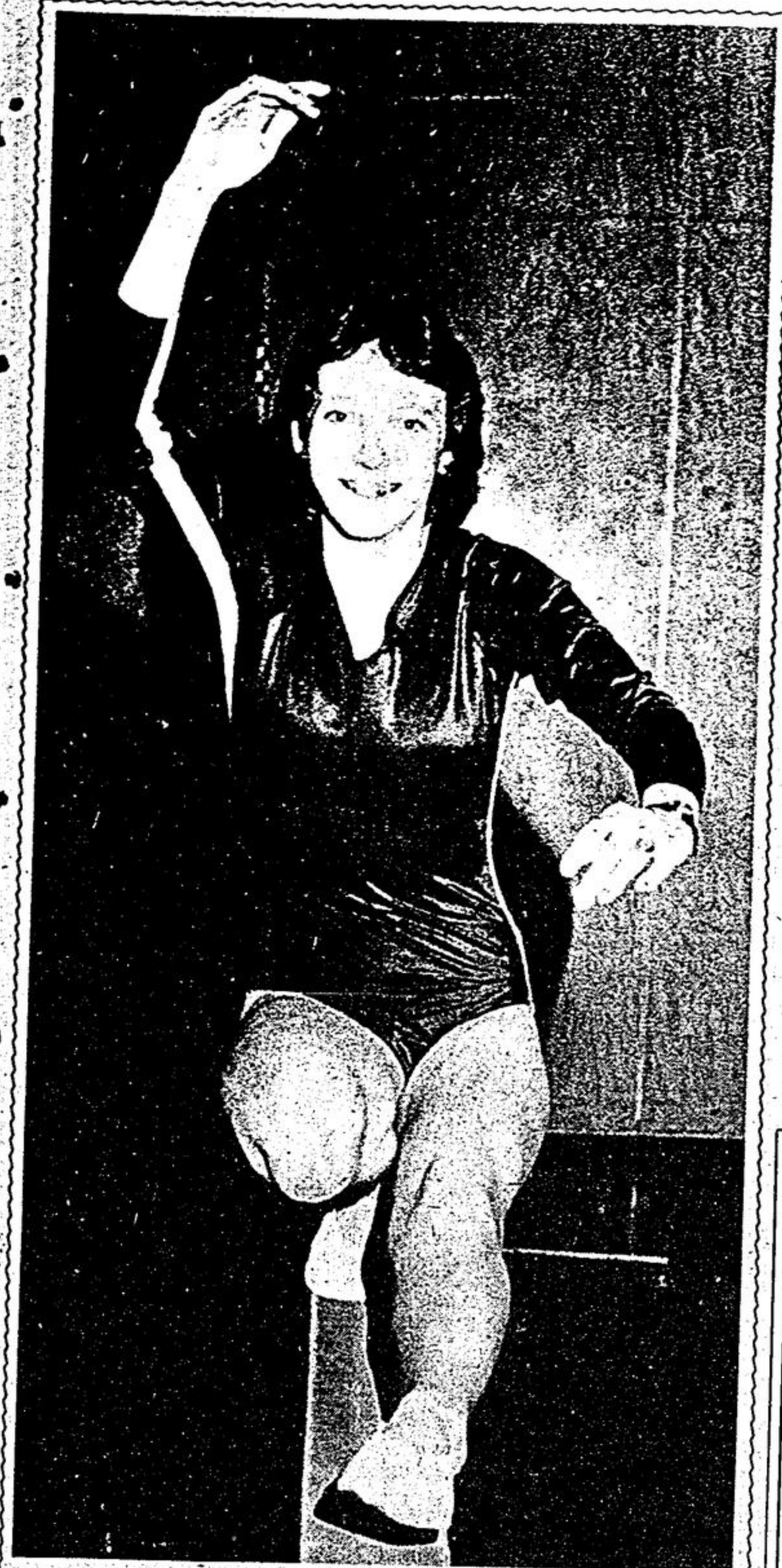
A well balanced gal