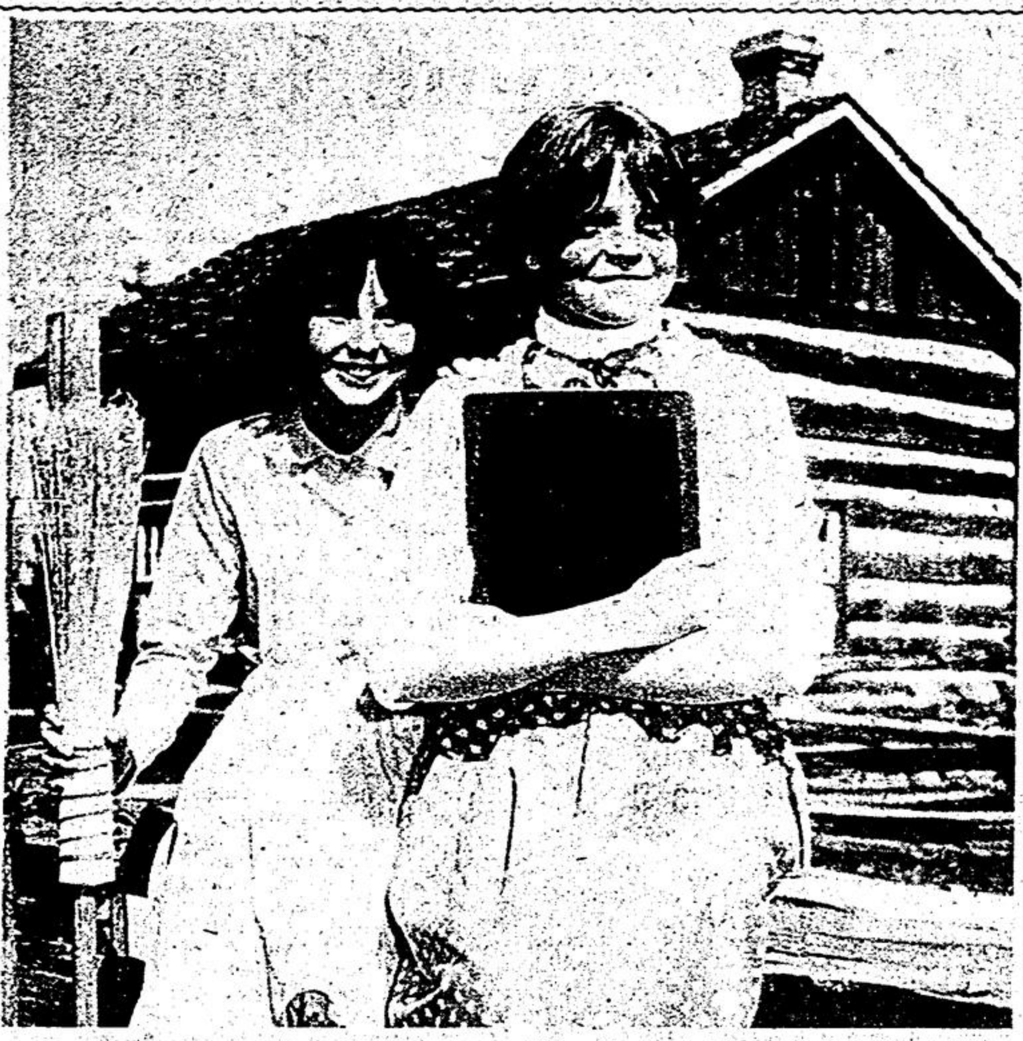
Last week, time was turned back for 57 Grade 6 students from Orchard Park Public School in Stouffville. They spent five days at Black Creek Pioneer Village and attended the century-old schoolhouse there.