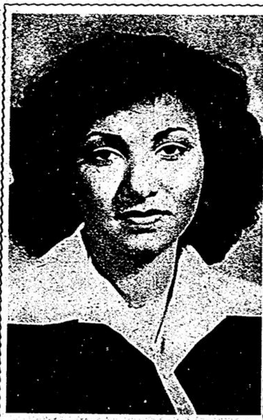
Shaw College graduate