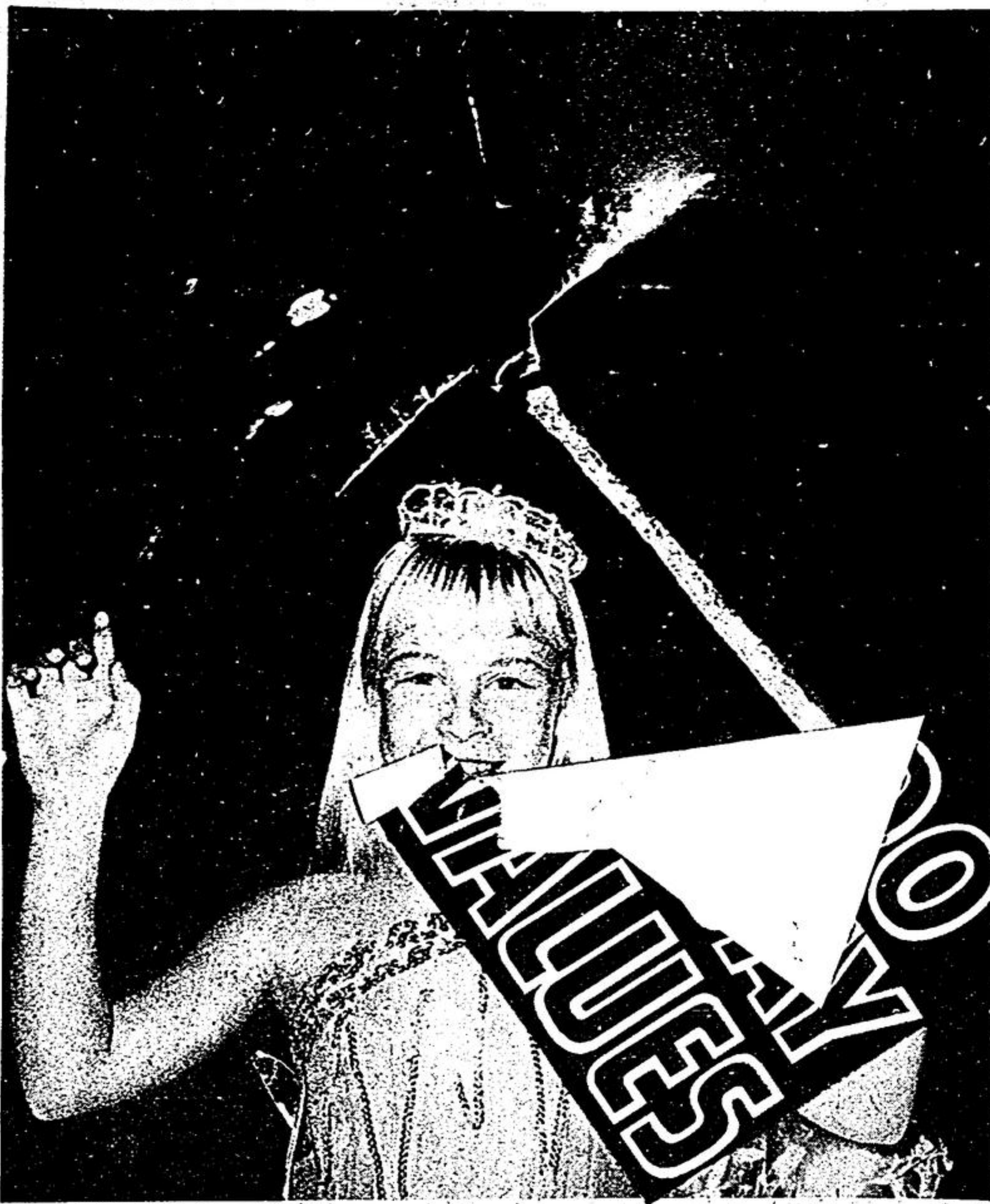
Fairy princess at Summitview Christmas concert.