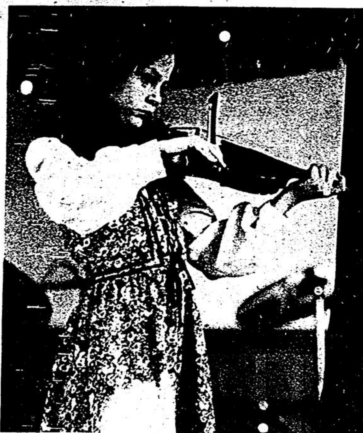
A wealth of local talent was revealed, Sunday, when Claremont held its annual Christmas Variety Show in the Community Hall. Two of the

The Claremont United Church choir and Sunday School are holding a Christmas Candlelight Service, Sunday, Dec. 17 at 7:30 p.m.