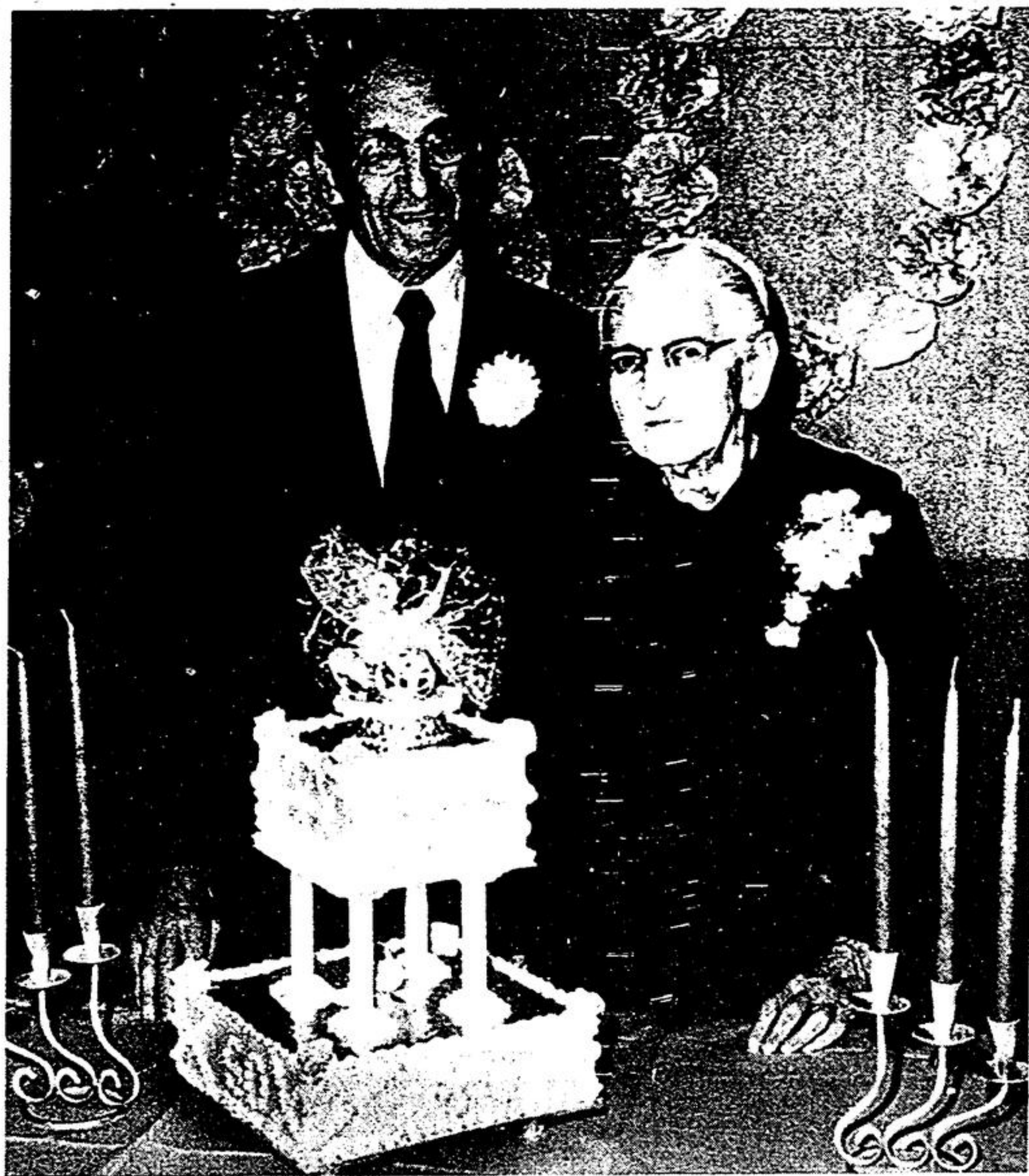
Married sixty years