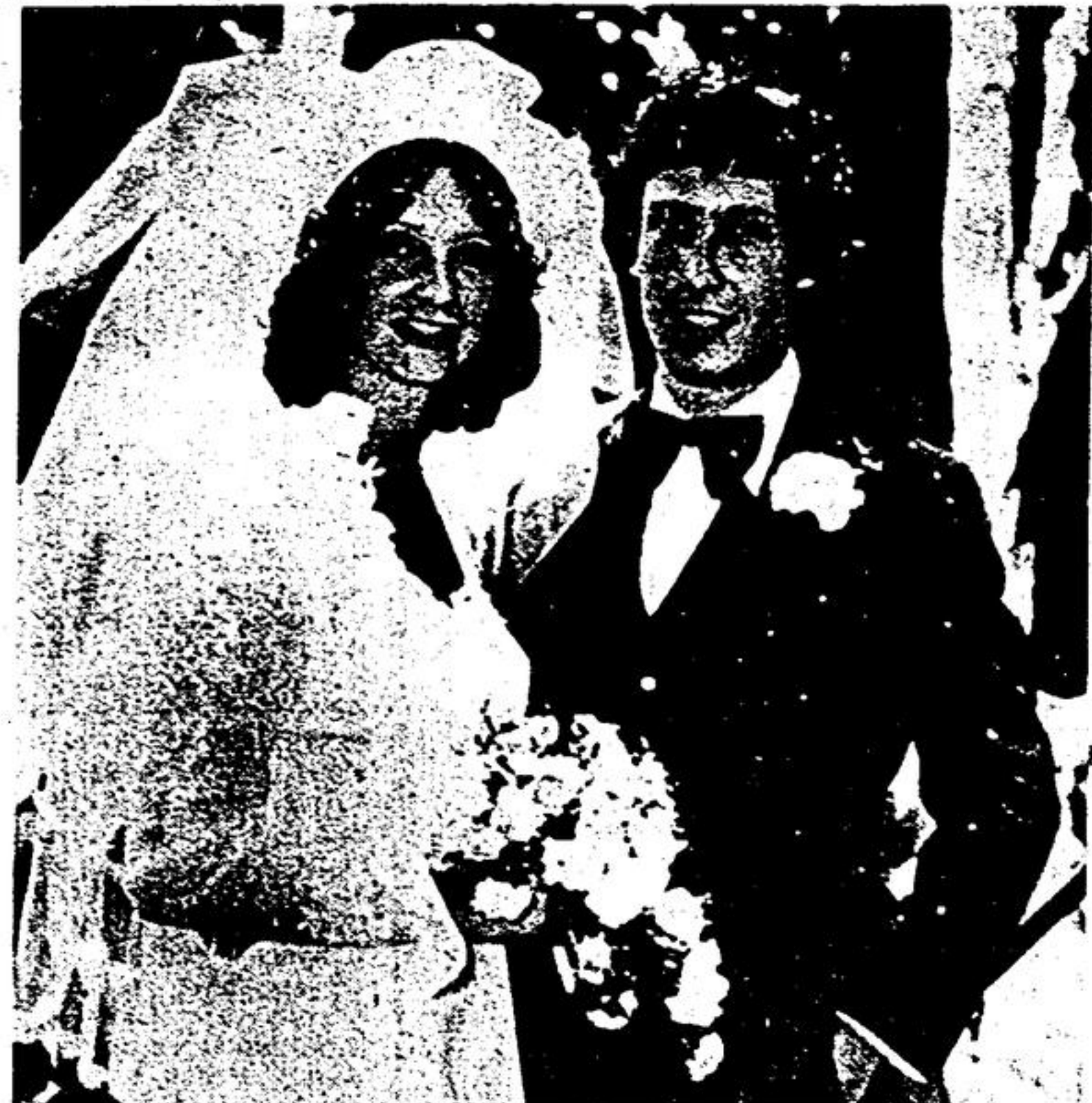
Married in Stouffville United Church