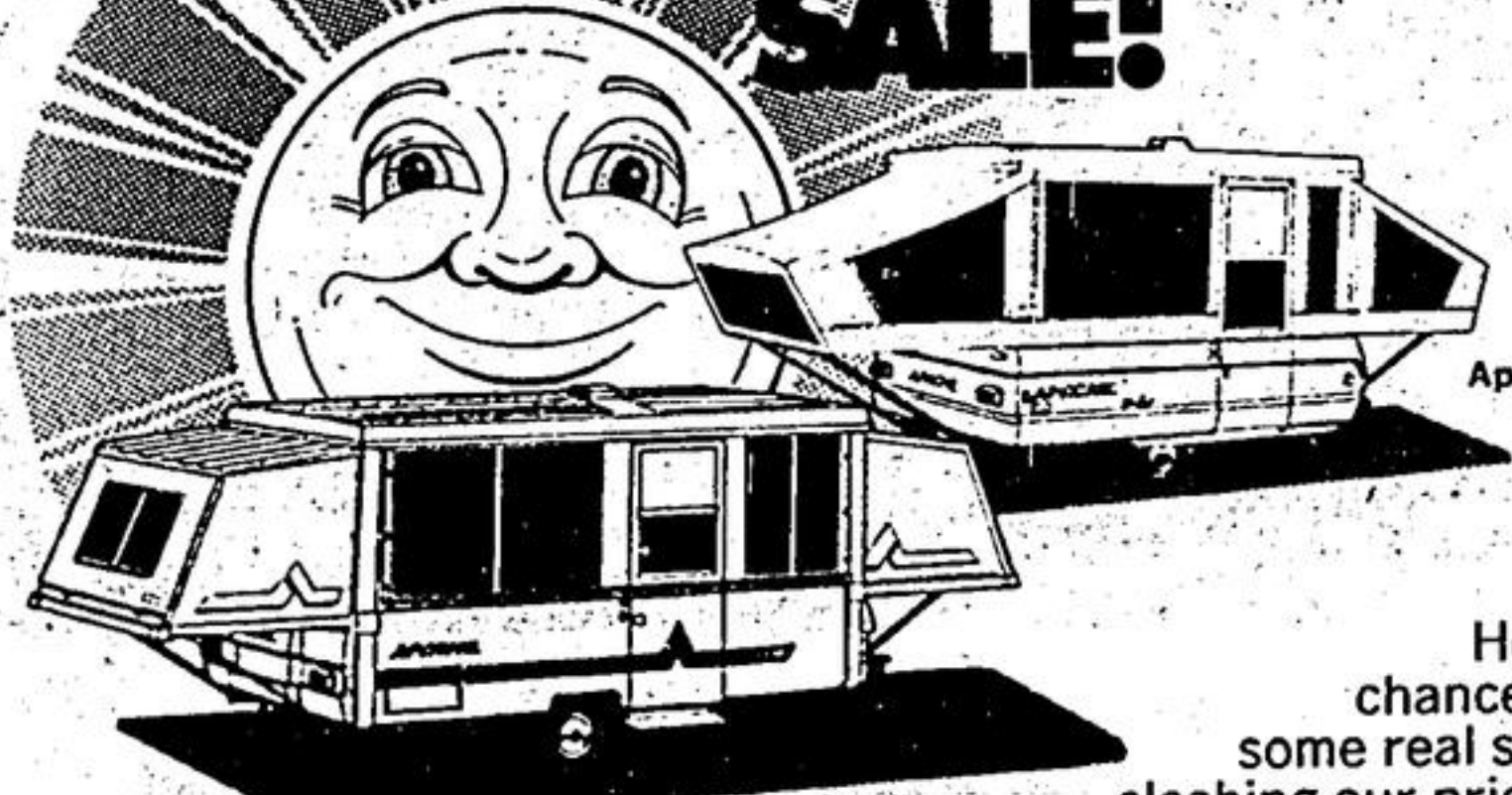
Apache War Eagle: A lightweight economical tent trailer that's ideal for today's smaller cars.