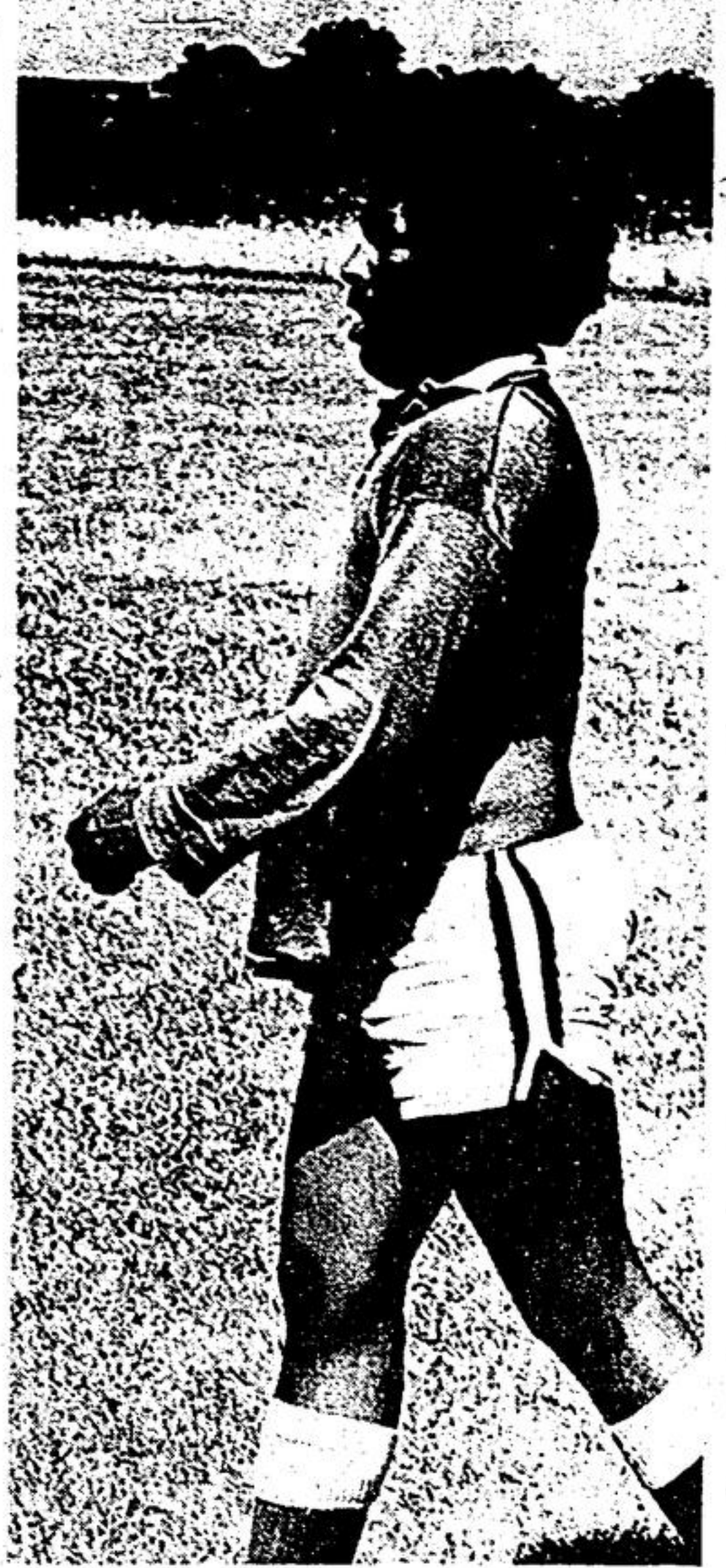
Player above had his shirt customized during play. Rugby is a rough game and that apparently, judging from the t-shirts and bumper stickers, is part of the appeal.

In the B division it was an all-Ontario final, as Balmy Beach pulled off a 16-12 victory over the Toronto Barbarians.