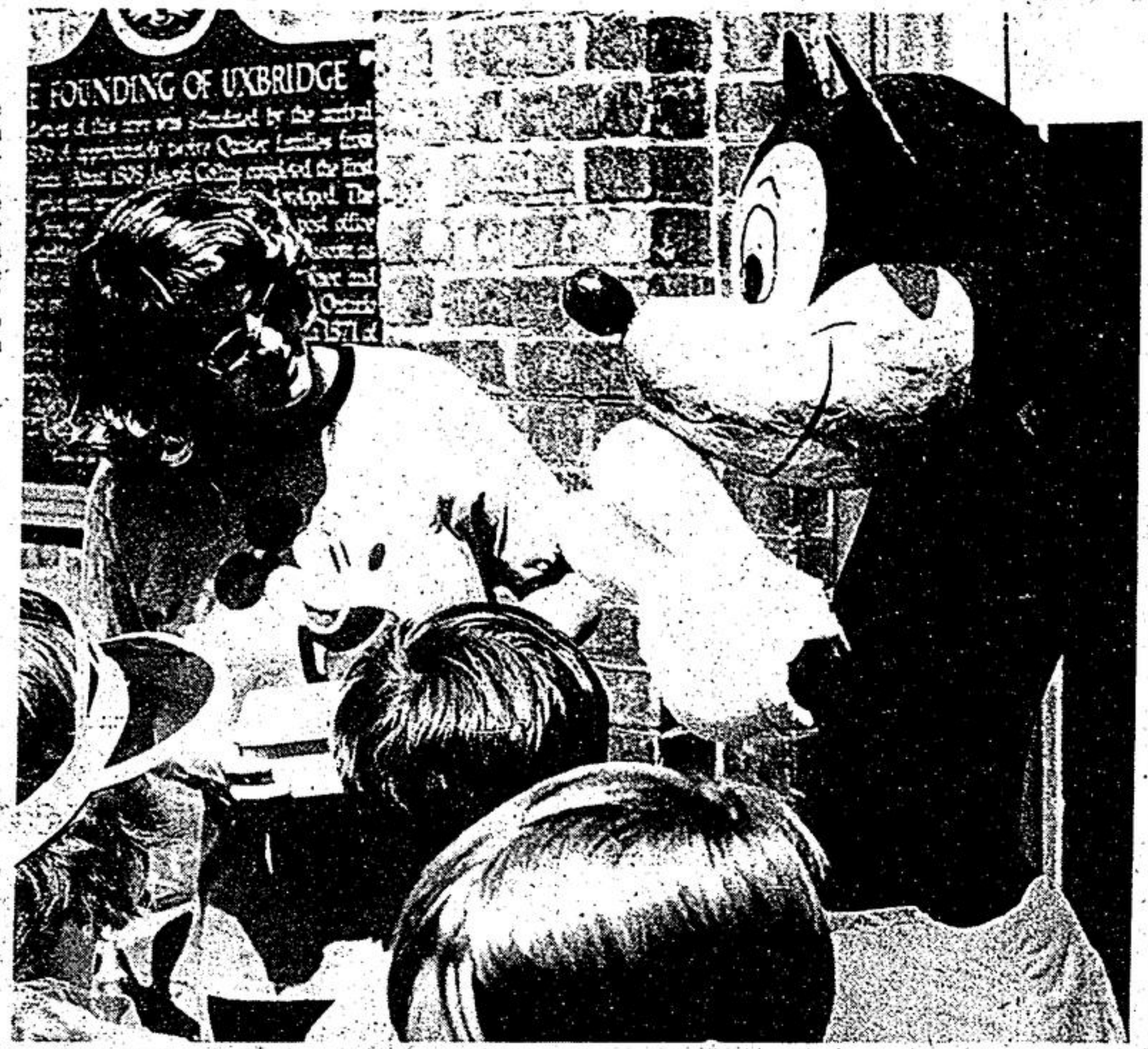
Mickey Mouse is 50 years old this year, and to help celebrate the Uxbridge Public Library held a birthday bash for him. The children were shown films and given balloons

Everyone in Uxbridge must be breathing a huge, satisfying, sigh of relief following their highly successful five days of craziness. The Spring Water Days festival ended last Sunday in what Ed Evans, organizer, called "the best year ever." The festival was blessed with great weather and the largest crowd in its history. It was estimated there were over 700 cars in Elgin Park for the Sunday activities, along with the 100 cars parked on the adjacent street. An indication of how successful the festival was, was the 400 lbs. of roast beef used for the barbecue dinner on Sunday, to feed approximately 700 people. The only hitch in the activities was the hour delay for the parade on Saturday. Apparently one of the marching bands' instruments failed to show up on time, and in fact are still missing.