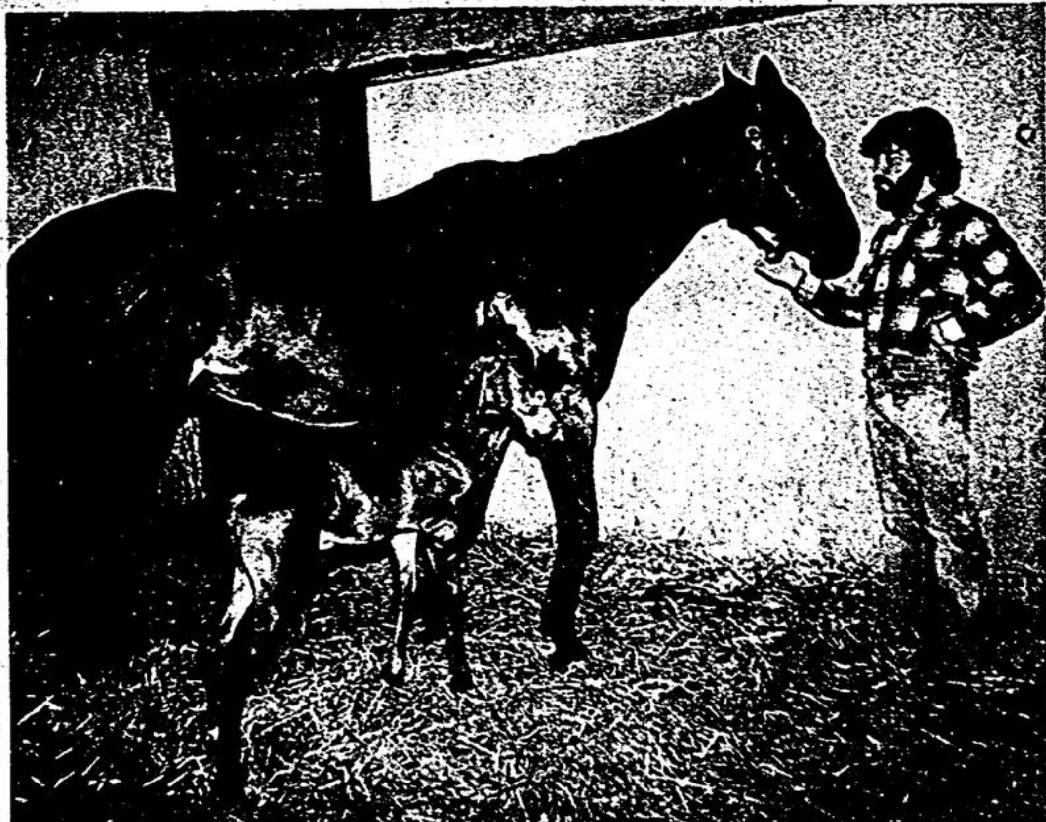
Most horses at the ripe old age of 24 have long since been put out to pasture, but Miss Gibson, a thoroughbred owned by Longview Farms on Bloomington Rd. had other ideas. Last week she gave birth to a handsome little foal. The tiny, frolicsome stallion, much to