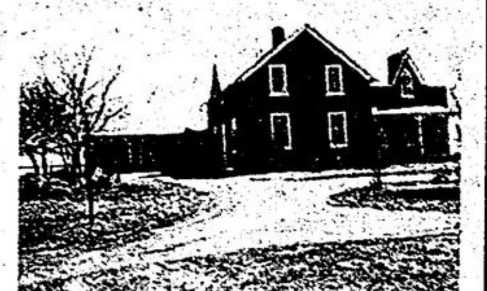
CENTURY FIELDSTONE With gingerbread trim on 1 1/2 acres overlooking Uxbridge. Centre hall with open stairway, deep window seats, 4 large bedrooms, new carriage house, original pine floors. A real beauty. For appointment to view call Ruth Dick 852-3592.

UXBRIDGE TOWN Zoned Highway commercial this good 3 bedroom brick home on large lot would make an excellent starter home, offices or small business establishment. Asking $50,000.00. Call Myrna Clarke 852-3280.