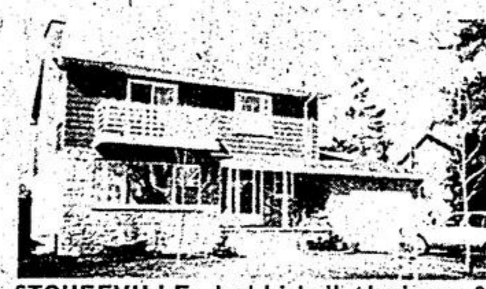
STOUFFVILLE: Just Listed! 4 bedroom 2 storey in older section of Town. 4 years new, separate living room with fireplace and dining room, large 21' x 13' kitchen, central air, fenced yard, paved drive. This home is exceptionally decorated, appliances included carpeted throughout. Asking $81,000.00. Call Len Powell.