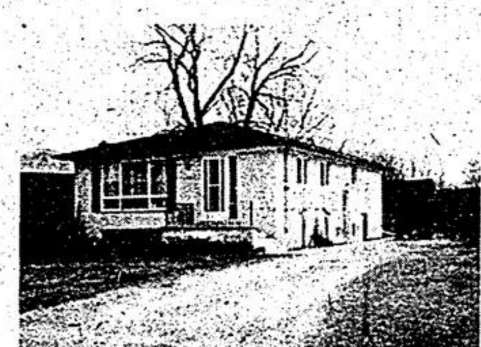
JUST LISTED! Young or old you'll love this spotless 3 bedroom brick bungalow. Large lot, quiet street, close to all amenities. Only $64,500.00. Call Noreen McGuckin.