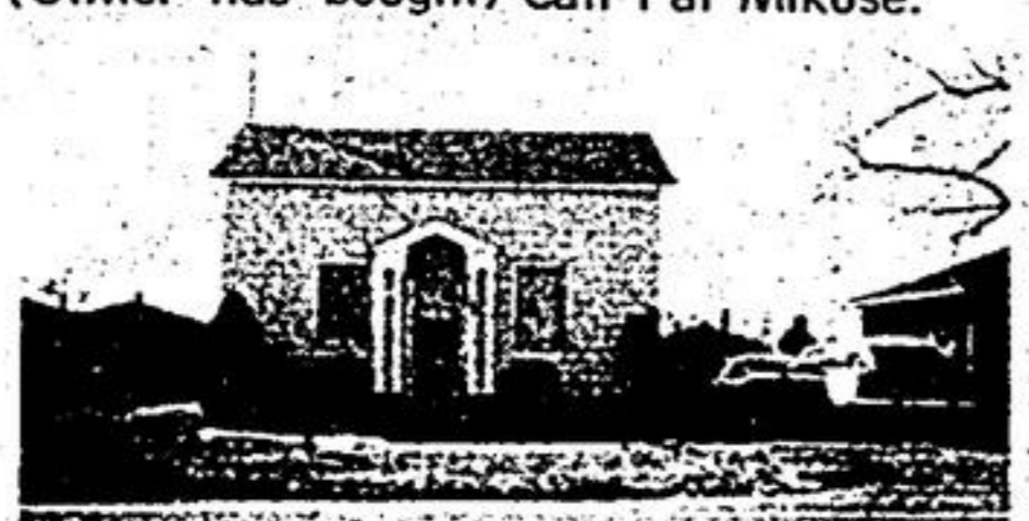
STOUFFVILLE: Just Listed! 3 bedroom century home on extremely large lot 72' x 159'. Hardwood floors, new kitchen, fenced yard. Asking $56,900.00. Call Len Powell.