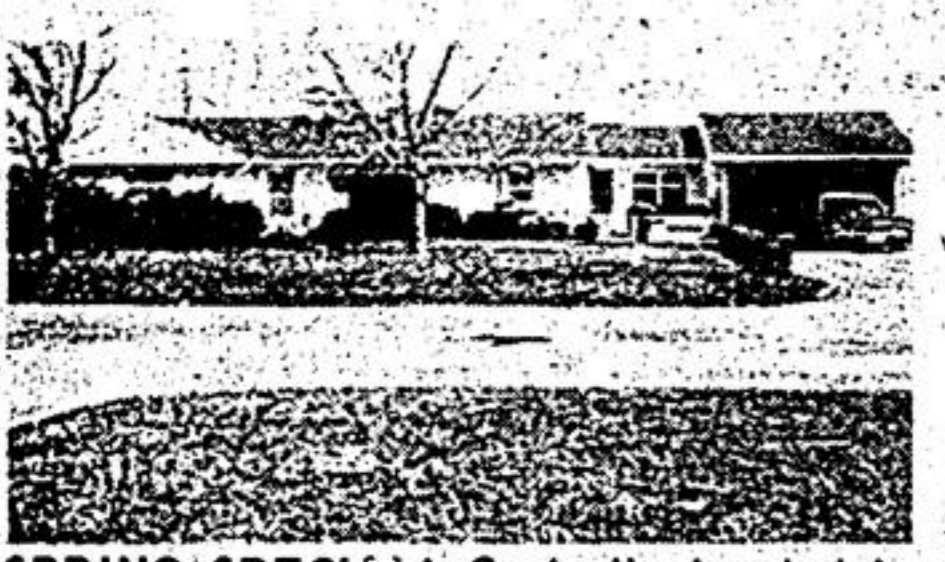
SPRING SPECIAL! Centrally located in Stouffville, this bungalow features a ceiling to floor stone fireplace in the spacious living room, main floor family room and attractively landscaped lot. A bonus for the purchaser — Vendor will hold a large first mortgage. $62,900.00. Call Joyce Spensley.