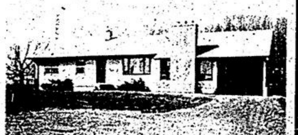
CLOSE TO TOWN: 3 bedroom bungalow with 13' x 27' main floor family room featuring a log burning energy saving fireplace on a 90' x 300' country lot.