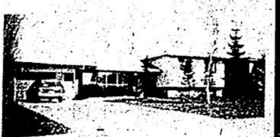
STOUFFVILLE: 5 bedroom sidesplit, extra kitchen in lower level, designer's kitchen, lovely landscaped lot, paved drive. Reduced to $72,900.00. Call Len Powell.

BEST 4-BEDROOM BUY IN TOWN: Brand new home on lot 50' x 105' centrally located, 5 year H.U.D.A.C. warranty. Asking $64,900.00. Call Len Powell.