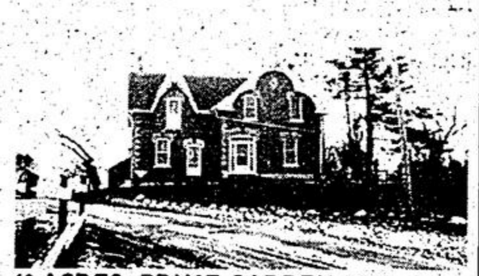
60 ACRES, PRIME GARDEN SOIL. Bank barn and drive shed. Turn of the century 10 room plus brick farmhouse in excellent condition 1 mile from Sunderland on paved road. Asking $145,000.00. Call Nels Houston.