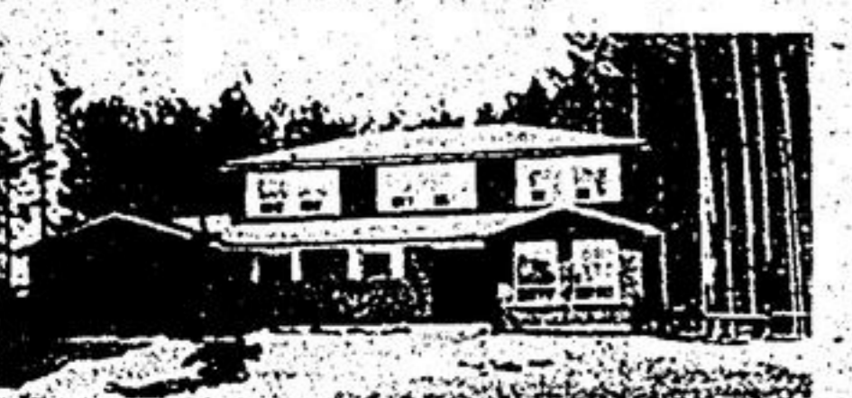
STOUFFVILLE 5 MILES NORTHWEST: Gracious 4 bedroom home on over 1/2 acre treed lot. Main floor family room with fireplace, 40' x 20' inground pool, fenced, paved drive. Many extras. Asking $127,900. Call Len Powell.