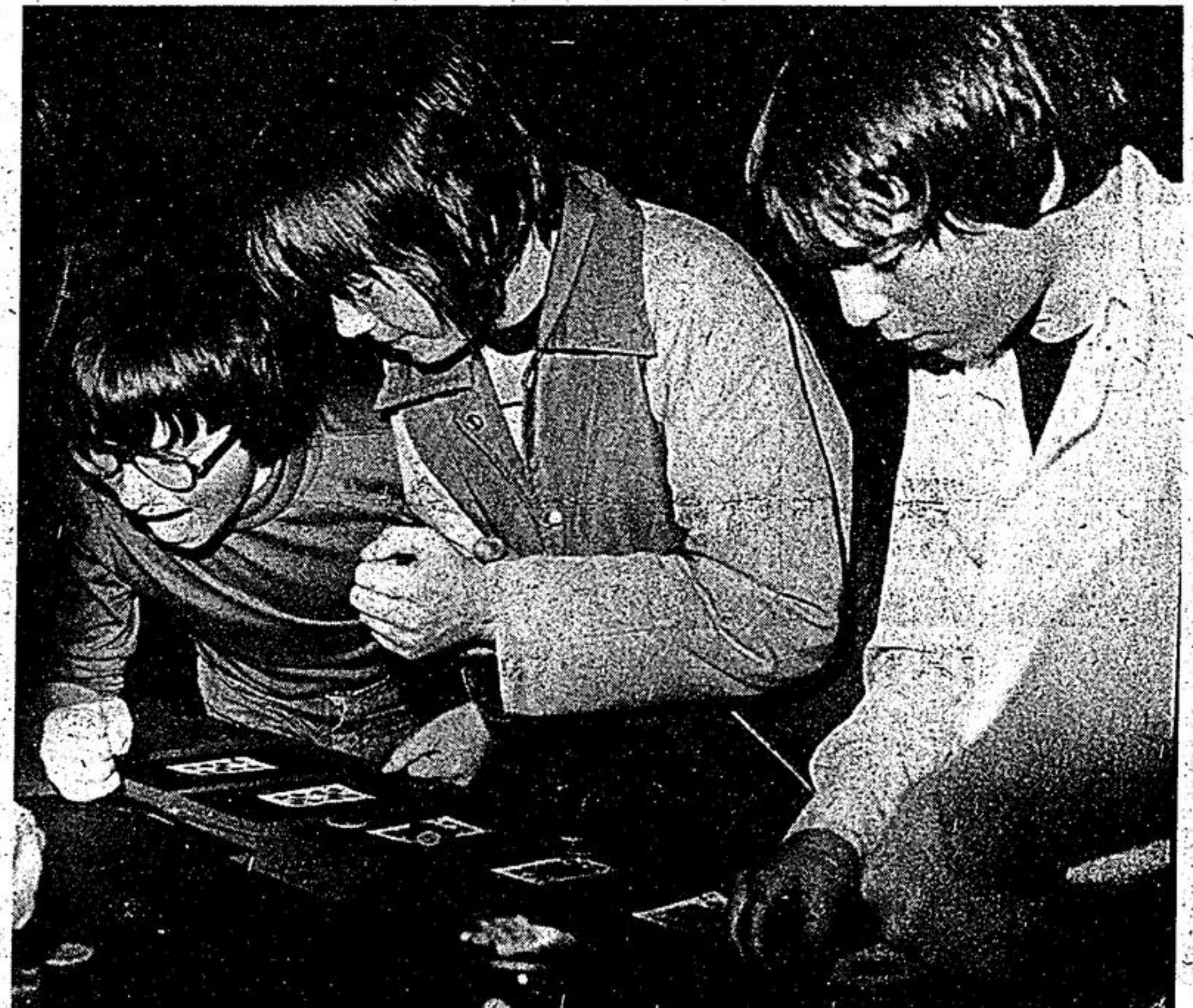
The odds may be against them, but these young gamblers take the game very seriously as they will their numbers to come up.