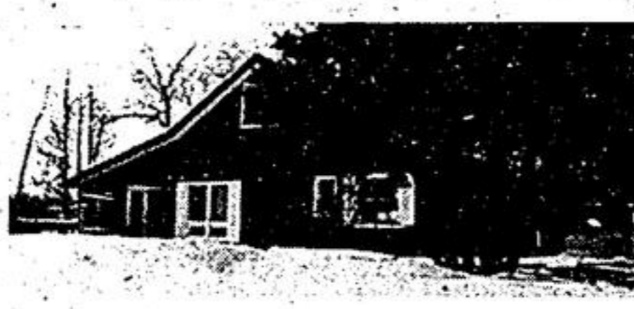
$61,500. RURAL HOME Overlooking lake near Stouffville with its own sand beach and change house. Ideal family home with 10 rooms, 2 level walkouts, rec. room with bar. Lot about 200 ft. deep with shade trees. Cec. Hendricks, 640-2082.