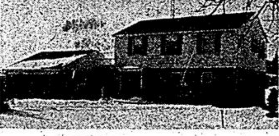
GORMLEY—4 BEDROOMS Main floor family room with corner fireplace and walk-out to fenced yard. Convenient kitchen. Quality built only 5 years ago. Don't miss seeing this one, $89,500. Mary-Jean Sider, 640-2082 or 887-5610.