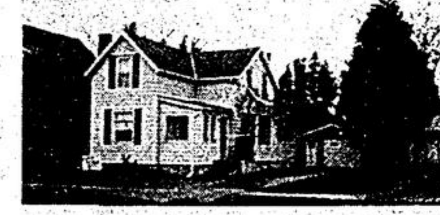
OLDER HOME UPDATED Stouffville, $68,900. Family room off dining room with Franklin fireplace. Lot 60 x 145 provides privacy. Main street location with all amenities within walking distance. John Ross, 640-2082.

START OR RETIRE In this aluminum clad home on older street. Built-in dishwasher, freezer and dryer included in the price of $48,900. Edna Luther, 640-2082.