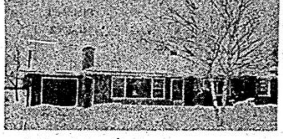
PERFECT LOCATION FOR CHILDREN You'll find charm and convenience in this bright 3 bedroom home. Family room with air conditioner. On quiet dead-end street in desirable area. $59,900. Bill Shields, 640-2082.