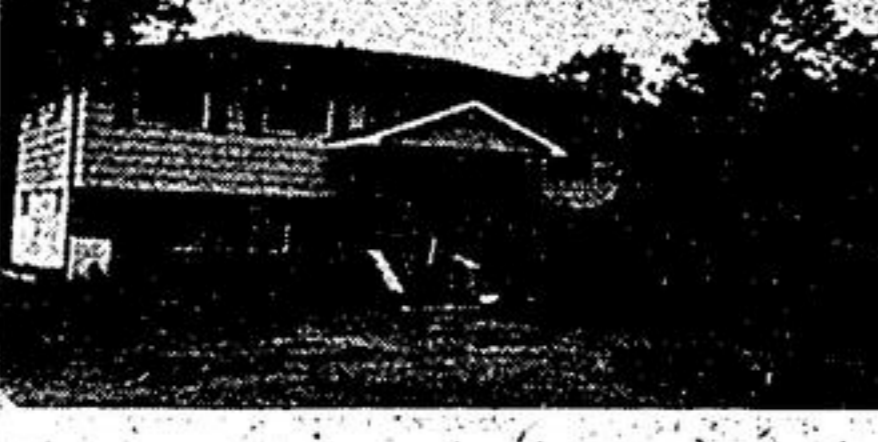
5 ACRE COUNTRY ESTATE Well kept home with up to 5 bedrooms possible. 2 fireplaces plus completely finished basement. Enjoy your own spring-fed trout pond. $114,900. Bill Shields, 640-2082.