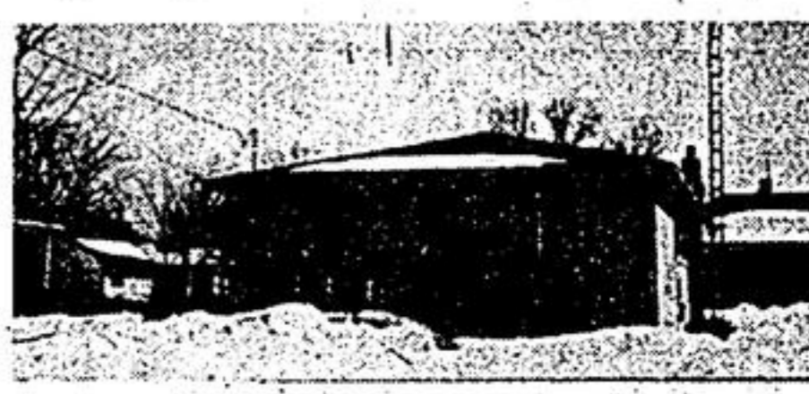
CENTRE OF STOUFFVILLE 8 Year old neat home with finished rec. room, new broadloom in living and dining area. Walk to shopping, park, schools. $59,900. Cec Hendricks, 640-2082.