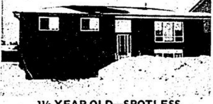
1 1/2 YEAR OLD—SPOTLESS 2 blocks to schools, shopping and Stouffville's recreation park with arena, swimming pool, ball diamond and tennis court. Realistically priced at $67,000. Kerri - Brangers, 640-2082.