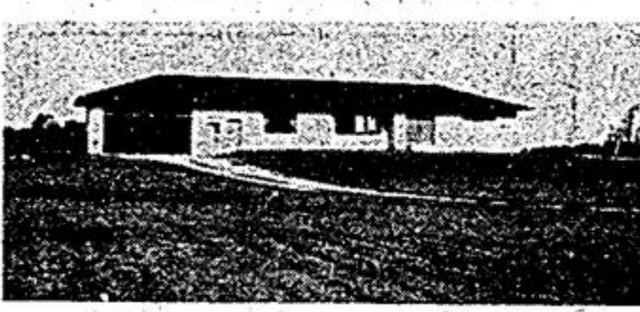
4 YEAR OLD HOME ON 10 ACRES Off Hwy. 47. Owner retiring to Florida. 7 rooms beautifully broadloomed fireplace, family room. Property lends itself to all 4 season living. Price is realistic at $99,500. Let's talk terms. Eileen Humphrey, 640-2082.