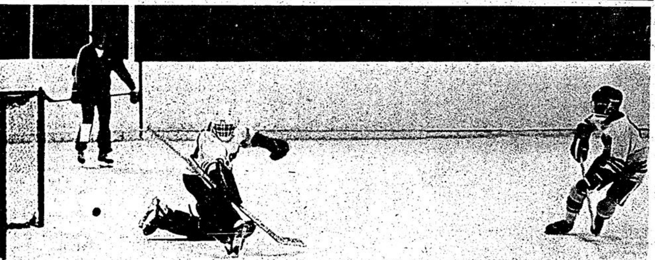
The above Bantam all star player puts one past the goalie, despite the fact the netminder got a piece of the puck with his pad. The action was at last Saturday's showdown

This Saturday night the Ken May Clippers play host to the Cobourg Cougars at 8 p.m. and on Sunday they travel to Bowmanville for a 7:30 p.m. game. The following Thursday the Clippers move to Port Hope for an 8:30 match.