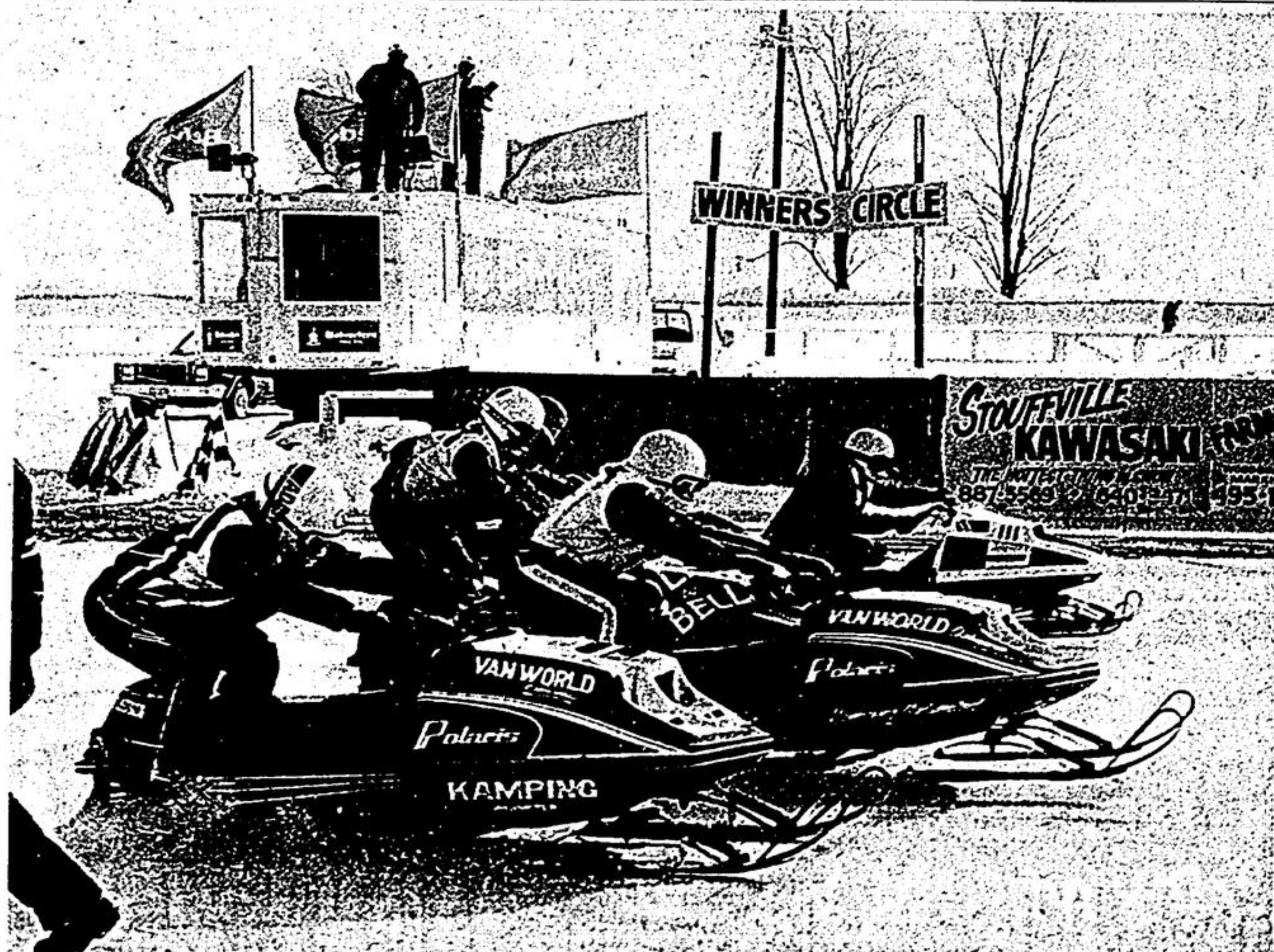
With a deafening roar, the racers blast off at the starting line during the snowmobile events held at the Markham Fairgrounds last week-end. Snowmobile en-