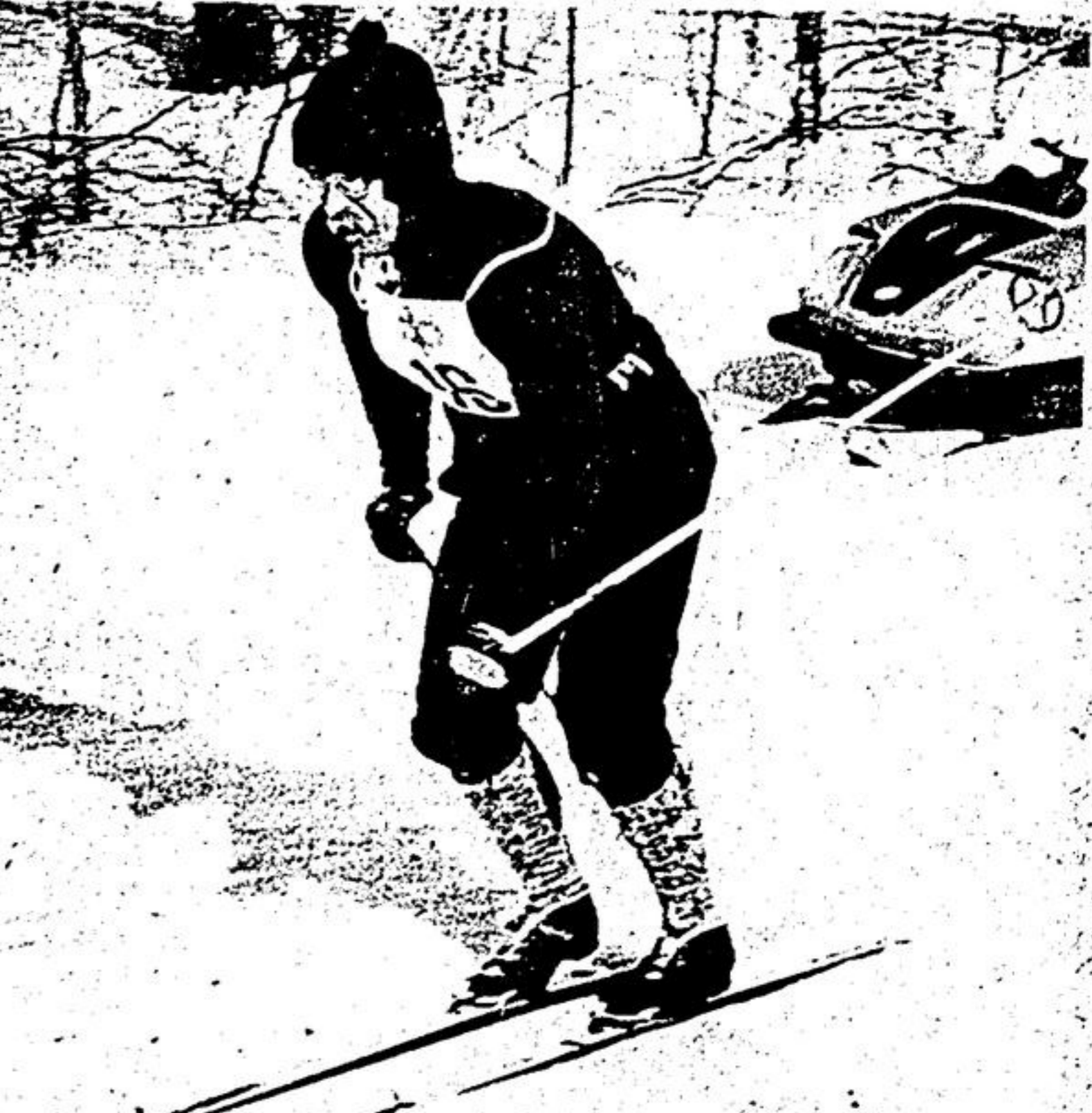
This racer is just starting on his cross country race at Dagmar last week. It was a beautiful day to hold the races, which have become an annual event at the Ski resort.

Every boy will receive an award for participating in Showdown.