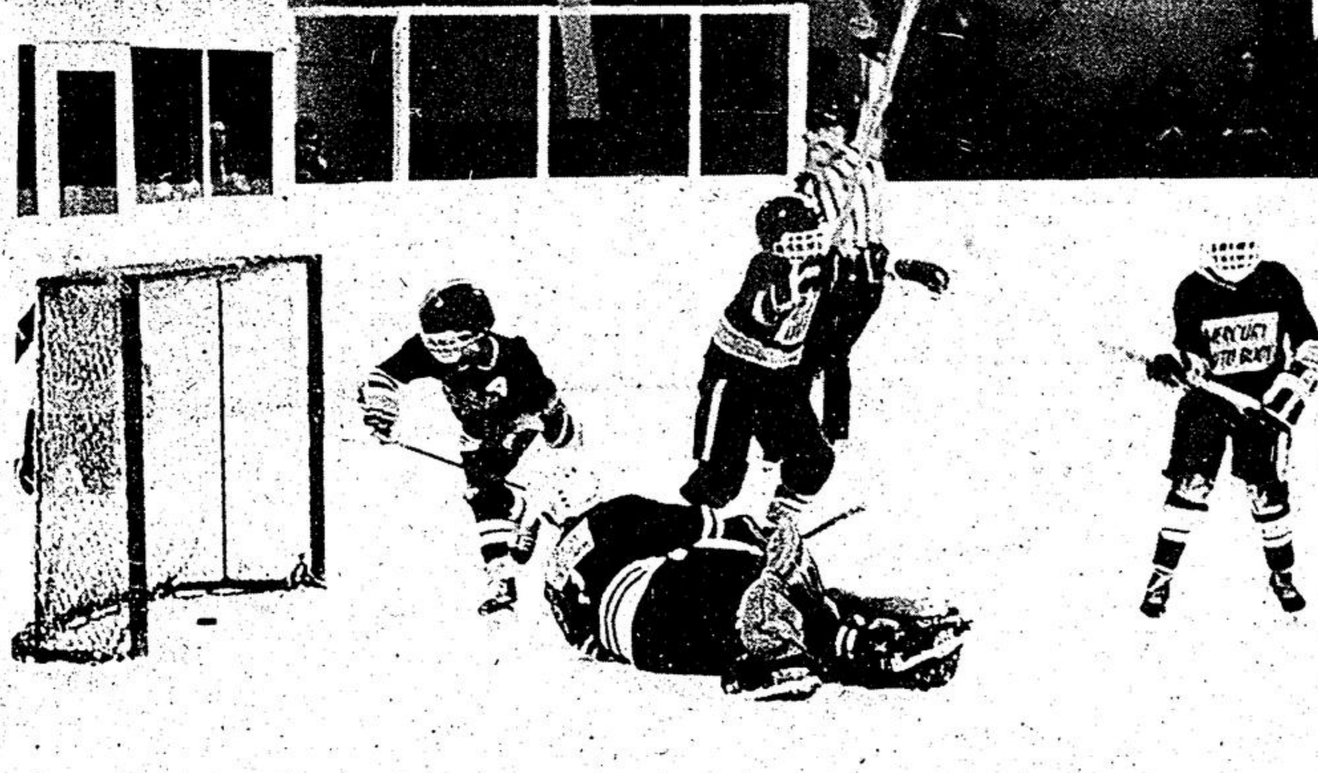
Stouffville's Peewee team ran into the tough Whitby team last Friday, and played a great game, coming away with a 4-4 tie. Above is Whitby's final goal, scored with only