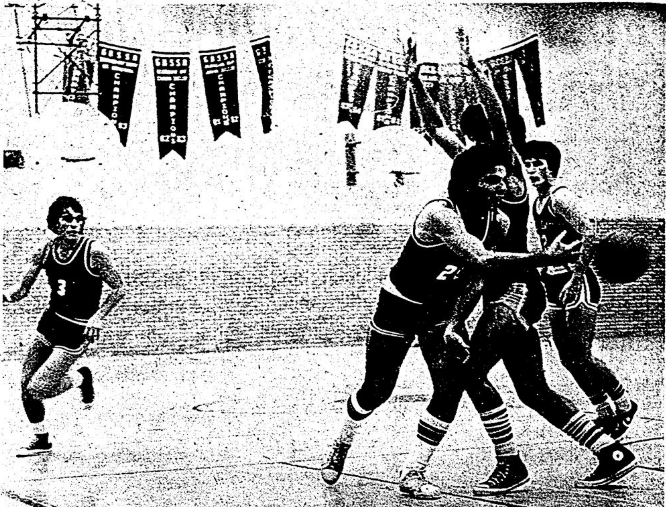
Stouffville's senior basketball team ran into the rough G.W. Williams squad from Aurora last week and came away with a tough 43-50 loss. Stouffville led for most of the game but wilted a little at the end. The Stouffville player above tries a neat back pass as the Williams opponent keeps a very close guard on him.