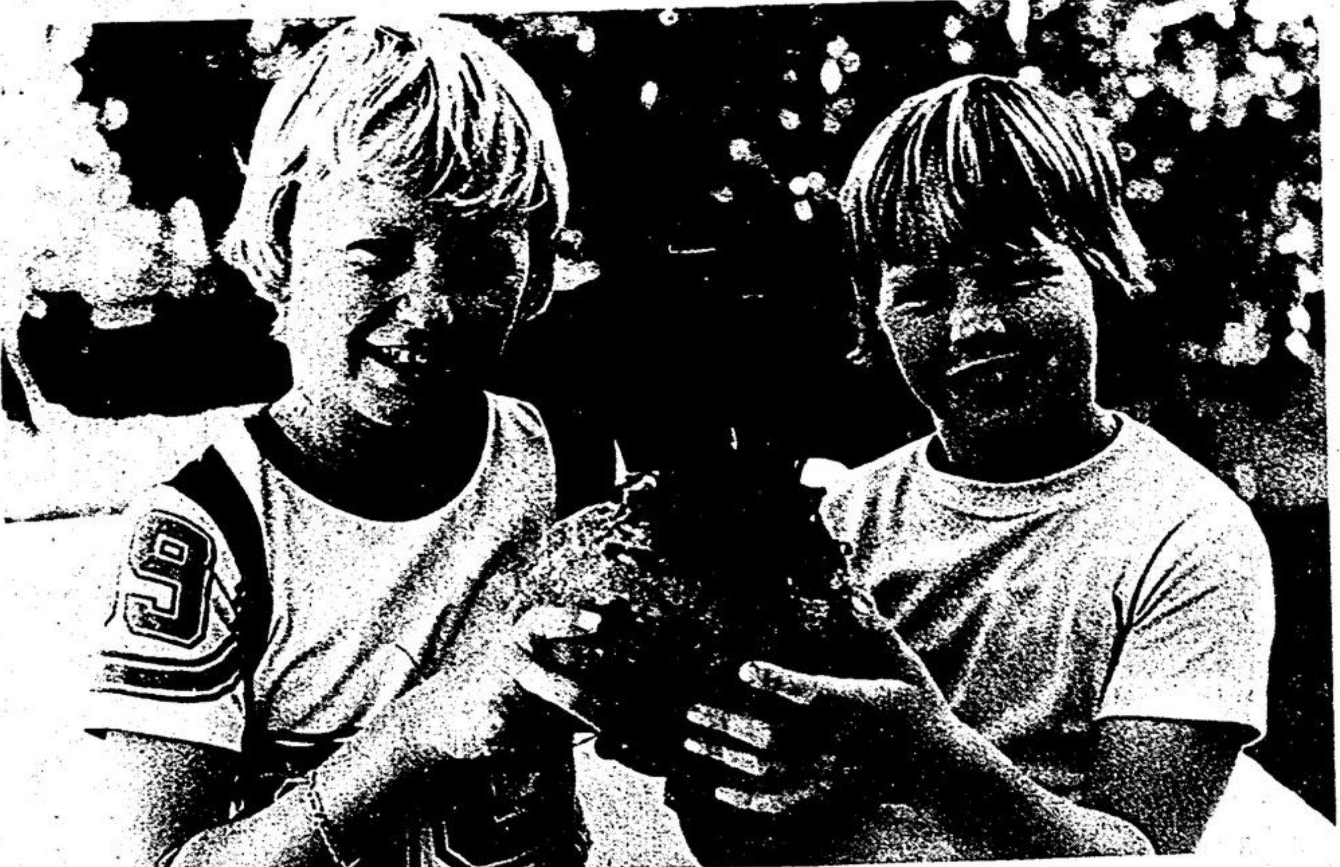
Brothers bring bigger beet