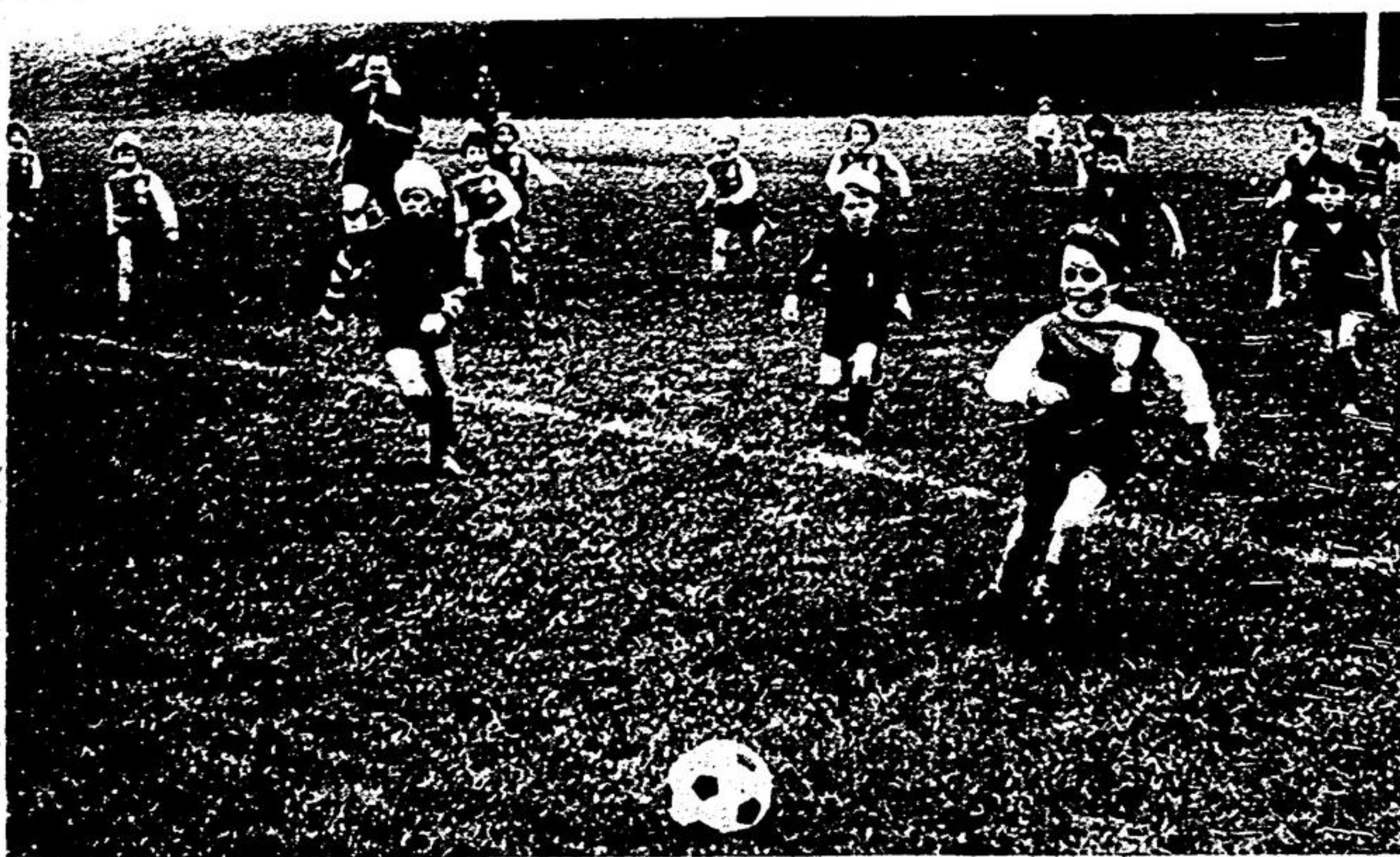
Everyone's after the ball in last week's soccer cup final in Aurora. The game was for the Squirrels final, pitting Stouffville against Aurora. Stouffville won the game, 2-0.