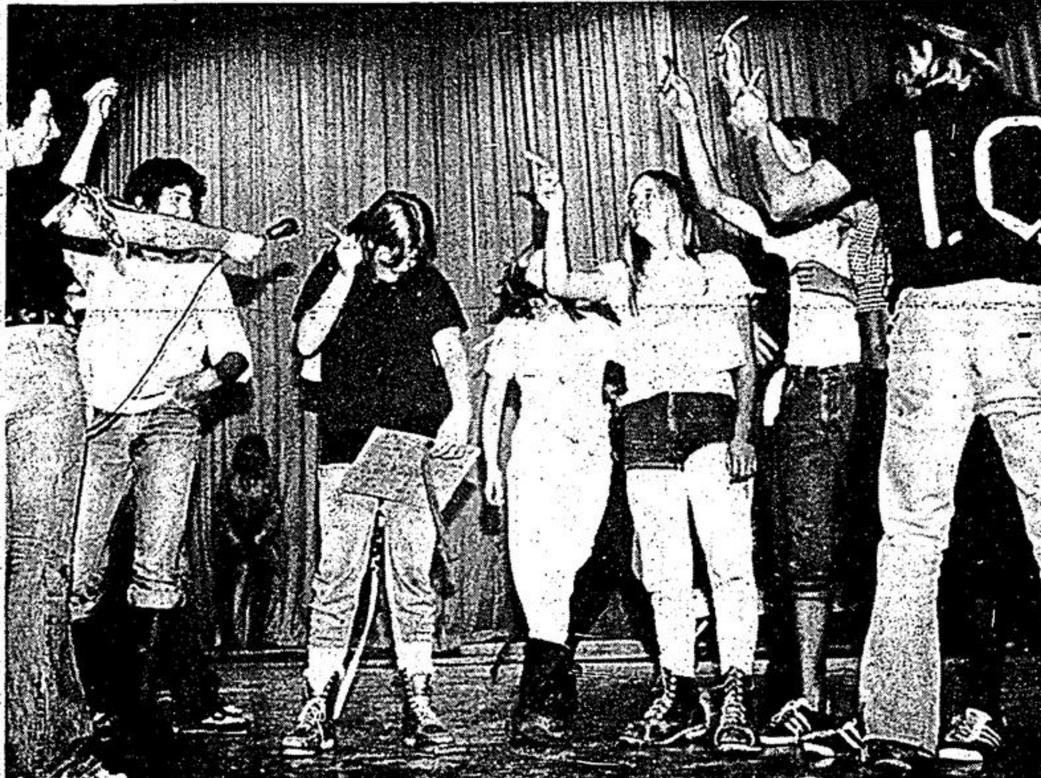
"Wagging their wieners as they sing the Oscar Meyer song, these grade niners ignore the hazing of the Initiation Committee