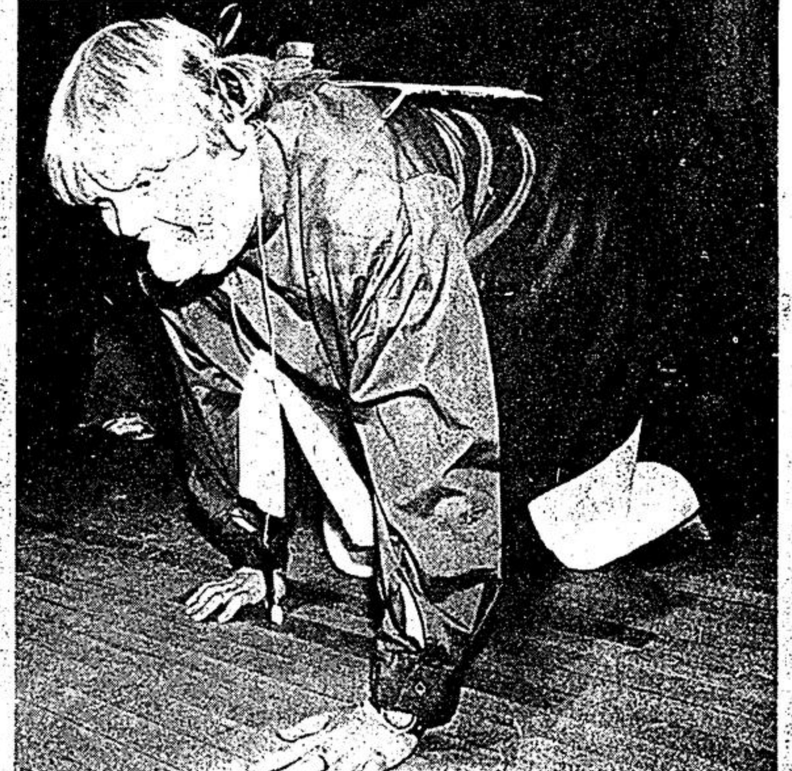
It's amazing how fast you can crawl when you have an onion in your mouth. Students didn't need any urging to hurry in the relay race — they couldn't wait to pass the nasty vegetable to the next person.