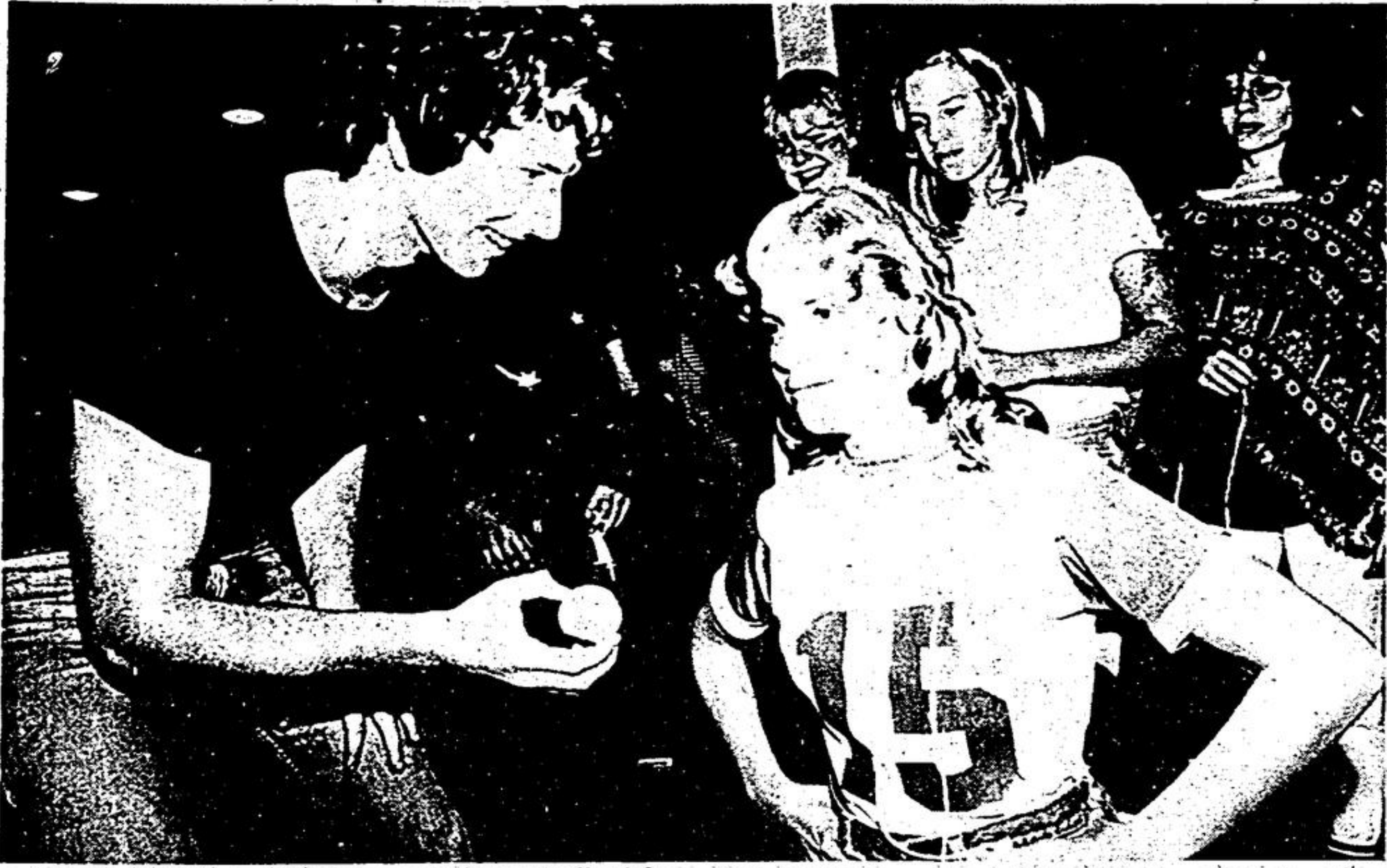
He's making her an offer she can't refuse — all grade nine students have to do as they're told on initiation day, even if it means biting into an onion. In the picture on the left it's almost impossible to tell the girls from the boys. The new boys had to wear girls tops stuffed, curlers, and nylons and the girls were glamorously attired in long johns,