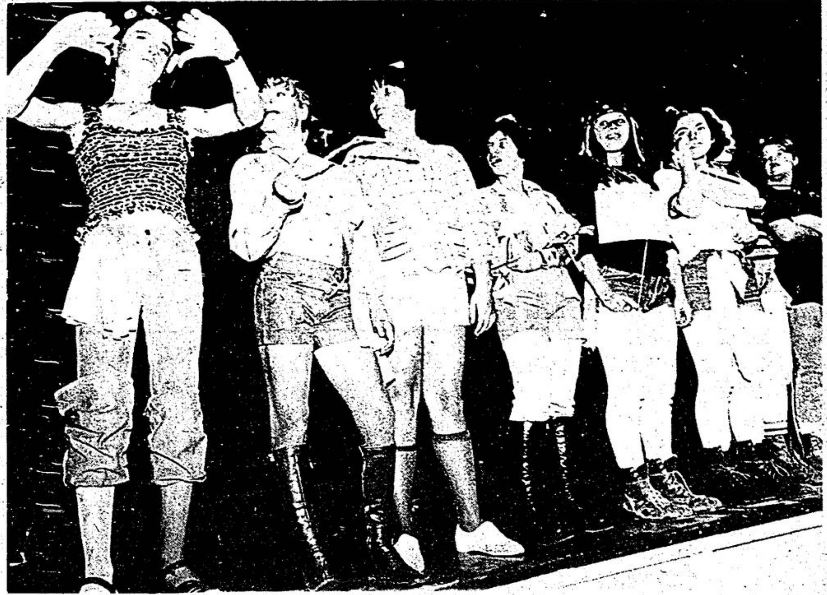
shorts, work boots and as many pigtails as the hair would allow. Both sexes were also equipped with a toothbrush and a cleaning cloth, and of course, a sign that read 'I'll shine your shoes, I'll wash the floor and love this place forevermore.'