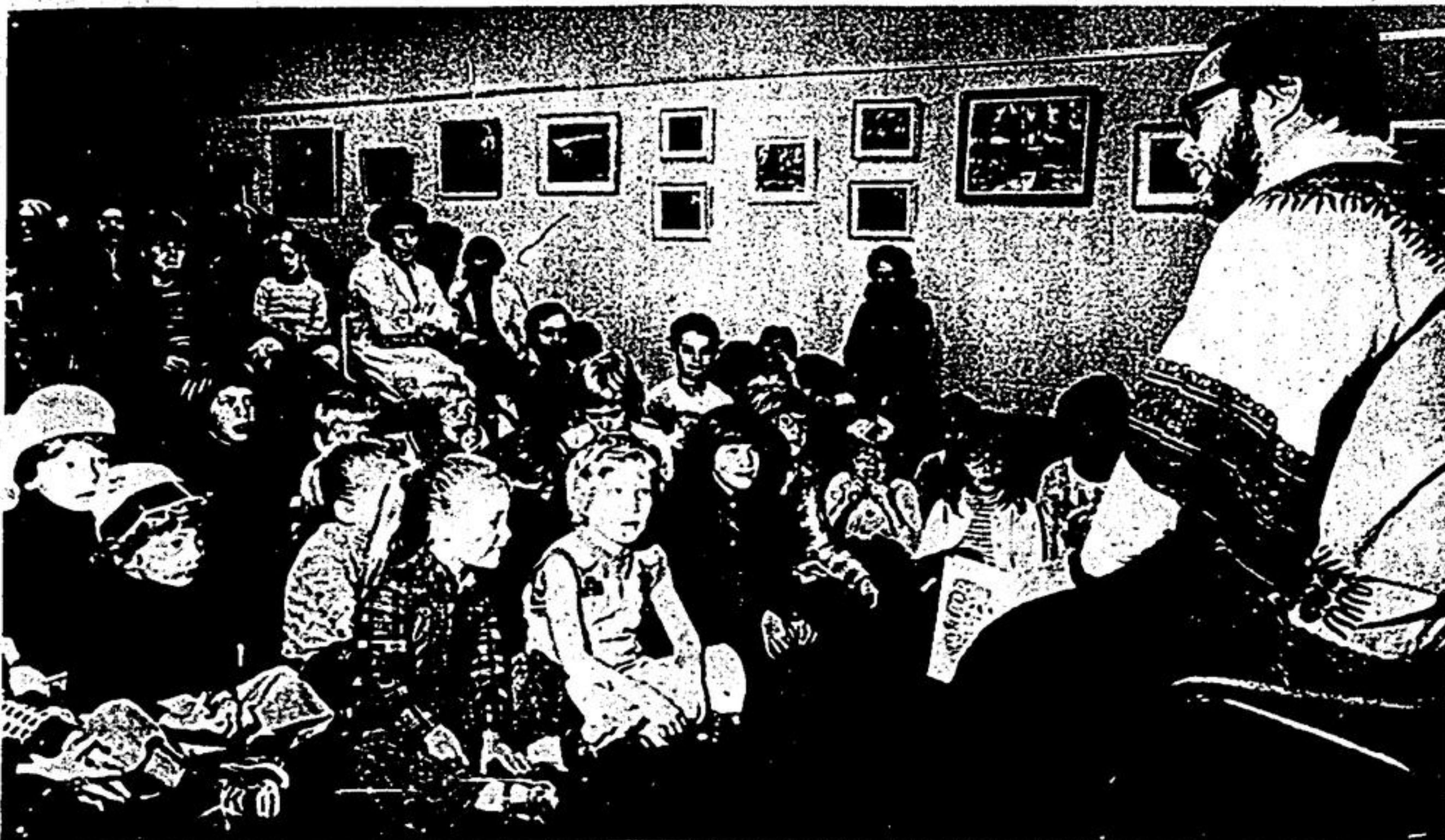
Children were fascinated by the antics of Dennis Lee, the author of Alligator Pie and Garbage Delight . The