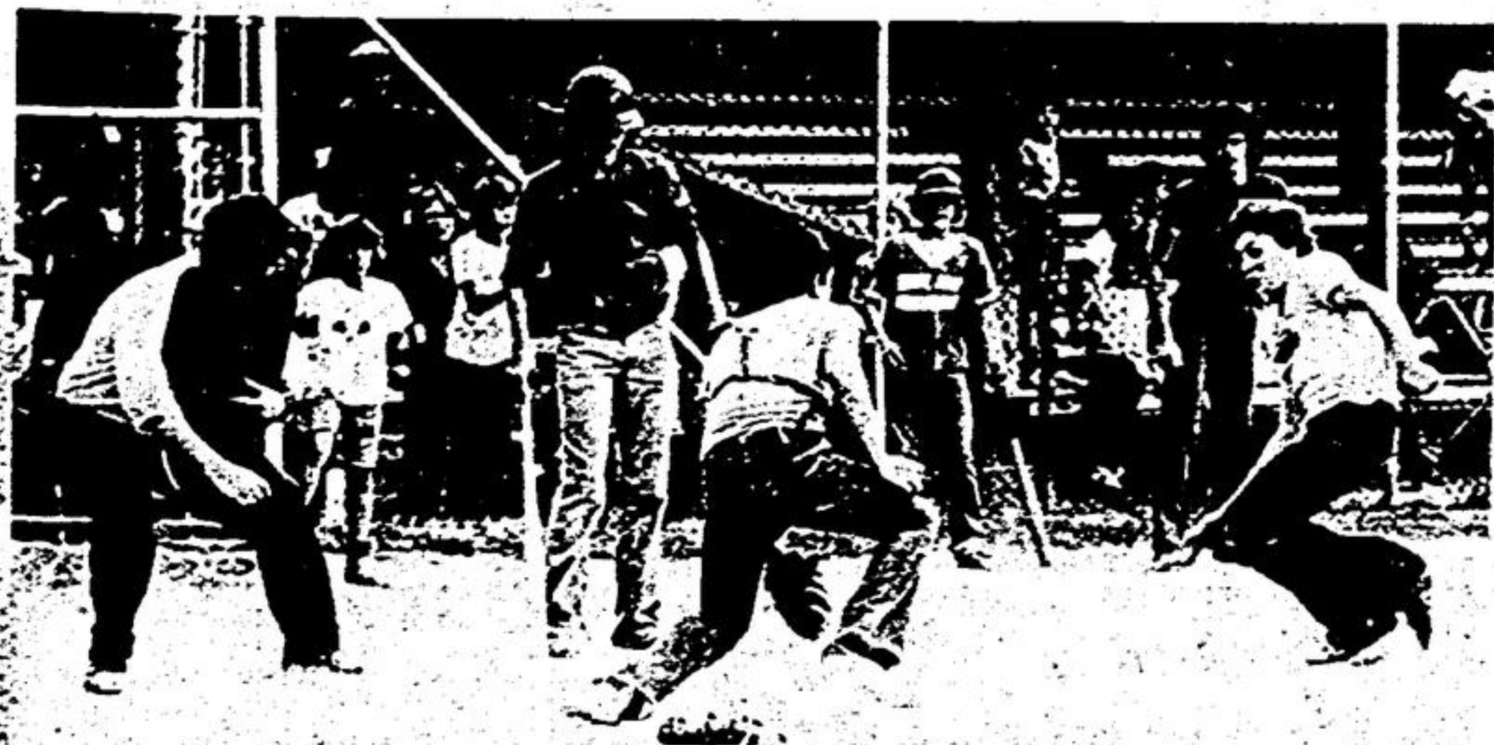
The school year ended recently and to make it an area baseball tournament was held in the park. The above picture shows a Summitview player sliding into home with an Orchard Park member waiting. Unfortunately for the Summitview player his attempt to steal home was thwarted by the Orchard Park player.